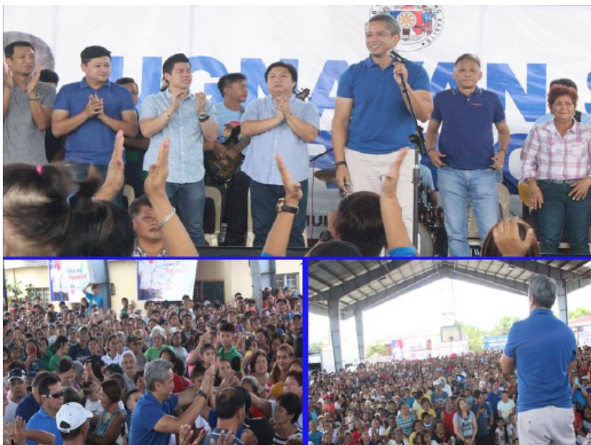
REACHING OUT THE LOCALS OF NOVELETA THRU UGNAYAN SA BARANGAY: In order to reach out the needs and current situations of their constituents, the Provincial Government of Cavite conducted another leg of Ugnayan sa Barangay at Seaview Subdivision Covered Court, Brgy. San Rafael II in the municipality of Noveleta on December 13, 2018. Governor Jonvic Remulla reiterated the plans and programs of the local administration that will ease the burdens of the citizens and contribute a big impact on the lives of less fortunate Caviteños. Noveleta Mayor Dino Chua along with municipal councilors and former Provincial Administrator for Internal Affairs Enrico Alvarez also mingled with the locals and expressed their unwavering support in providing relief and hope in the community. (Julie Anne Rolle)