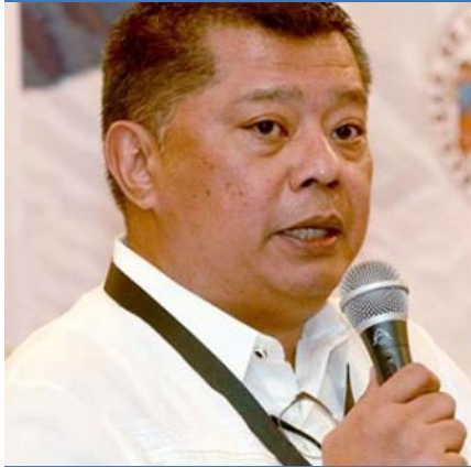
Atty. Jesus Crispin C. Remulla GOVERNOR