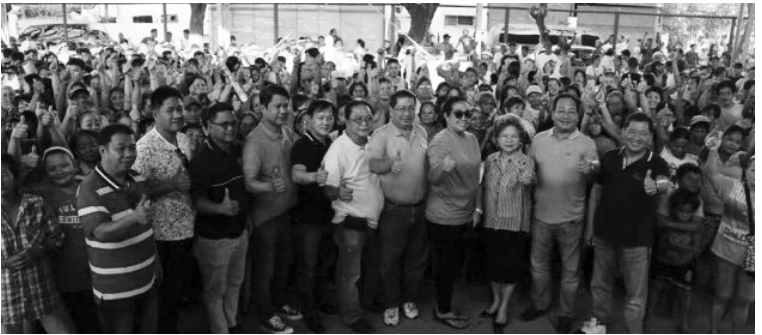
The campaign took off last Friday at several barangays including Mabolo 1, 2, 3 and Panapaan 2, 3, 4. City Mayor Lani Mercado Revilla encouraged all Bacoorenos to do their part in the city's quest for a clean environment. #1Team1Love1Bacoor #AlagangAteLani