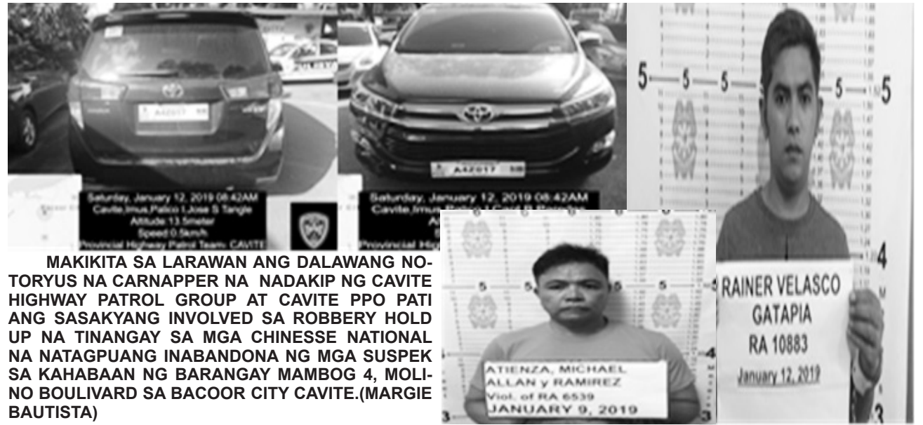
MAKIKITA SA LARAWAN ANG DALAWANG NORTORYUS NA CARNAPPER NA NADAKIP NG CAVITE HIGHWAY PATROL GROUP AT CAVITE PPO PATI ANG SASAKYANG INVOLVED SA ROBBERY HOLD UP NA TINANGAY SA MGA CHINESSE NATIONAL NA NATAGPUANG INABANDONA NG MGA SUSPEK SA KAHABAAN NG BARANGAY MAMBOG 4, MOLINO BOULIVARD SA BACCOOR CITY CAVITE.

If these prominent suspects believe they can massage the outcome of their cases or sway public sentiment to their favor by malingering—then that is perhaps their greatest affliction. Filipinos are becoming sick and tired of such antics