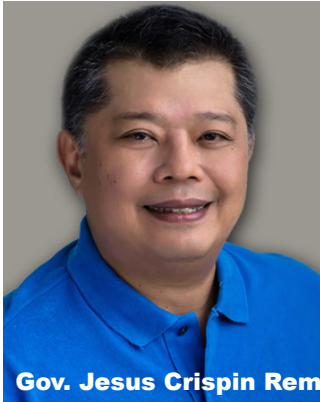
Gov. Jesus Crispin Remulla