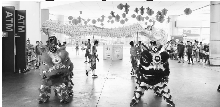
A very Festive Dragon dance welcomes the Year of the Earth Pig in SM City San Pablo.

Chinese New Year is the most significant holiday on the Chinese calendar. Apart from being a time to feast and reunite with family, the festivities are accompanied by a large array of customs and rituals. In Chinese culture the lion symbolizes strength, stability and superiority, while the dragon represents power, boldness and excellence and for this year 2019 marks the year of the earth pig, still it's always the lions and dragons