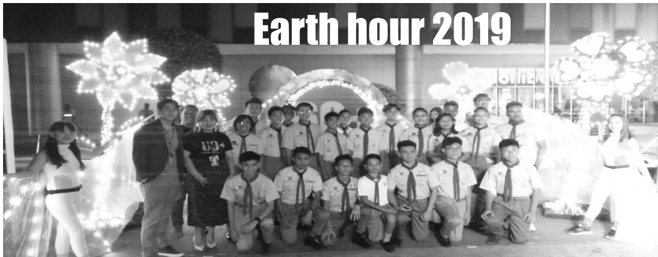
SM City San Pablo's celebration of the Earth hour draws youth participation such as Boys Scout of the Philippines San Pablo chapter in the lights off event held in the mall grounds Saturday, March 30, 2019. (Nina Wong)