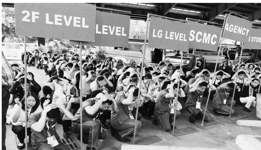
SM City Dasmariñas' employees together with its tenants once again participated in the National Simultaneous Earthquake Drill 2019. Headed by the Mall Operations, Customer Relations Service and Emergency Response Group of SM City Dasmariñas in cooperation with Dasmariñas CDRRMO, the drill was successfully concluded. The drill aimed to prepare the people for the coming of the BIG ONE which nobody knows when and where to occur. It encouraged customers' participation as well, so that they would know what to do in case it happens, most especially when they are inside an establishment.

To ensure compliance with Shari'ah principles, the bill mandates Islamic banks to constitute a Shari'ah Advisory Council, composed of persons qualified in Shari'ah law or who have knowledge or experience in Shari'ah law and banking, finance, law, or other related disciplines.