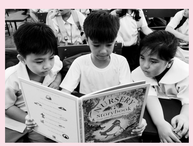
Kids were excited to check out their new books as The SM Store was able to donate books enough to fill up the mini book corner of Balanga Elementary School.