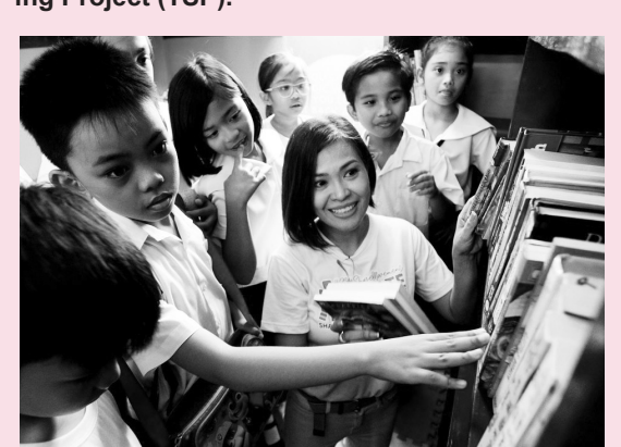
Kids started to read books donated by The SM Store.