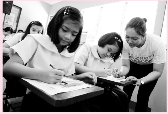
Children from Balanga Elementary School enjoyed a fun coloring activity as part of the story book reading session.

The SM Store Share Movement Donate-a-Book campaign is ongoing until July 7 in all The SM Store branches nationwide. Shoppers can share new and pre-loved gently used books. The SM Store also accepts school packs and text books.