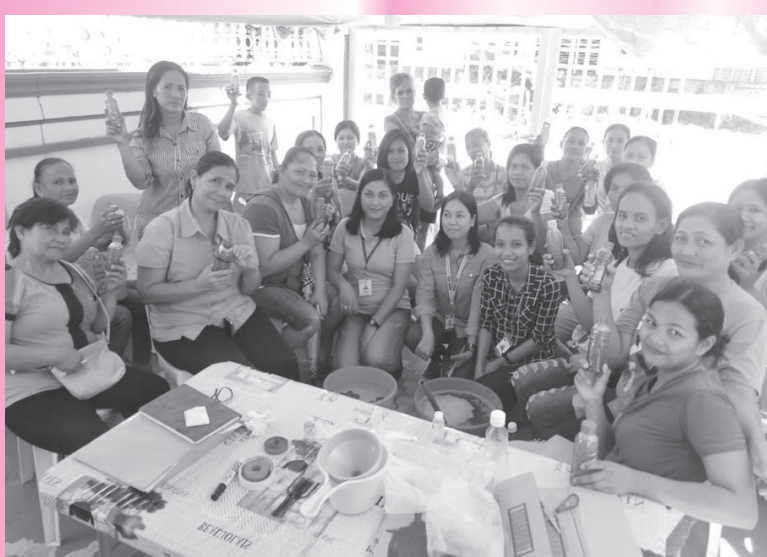
CMDI conducts livelihood training in Daet. Twenty-four (24) micro-finance clients of Center for Agriculture and Rural Development (CARD), Inc. in Daet, Camarines Norte were trained to make dish-washing liquid during the livelihood training program conducted by CARD-MRI Development Institute (CMDI) on March 15, 2019. Clients were also trained by Mga Likha ni Inay (MLNI) and CARD-Business Development Service Foundation Inc. (CARD-BDSFI) on how to package and market their product to become more appealing to its potential clients. CARD, Inc., CMDI, MLNI, and CARD-BDSFI are member institutions of CARD Mutually Reinforcing Institutions that aims to eradicate poverty by providing financial and community development programs such as capacity building.