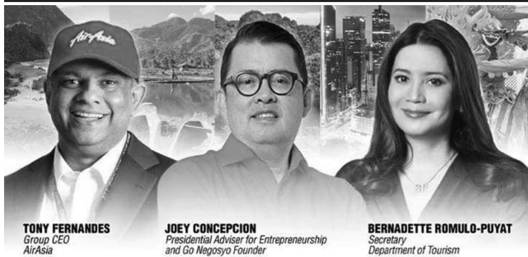
TONY FERNANDES Group CEO AirAsia