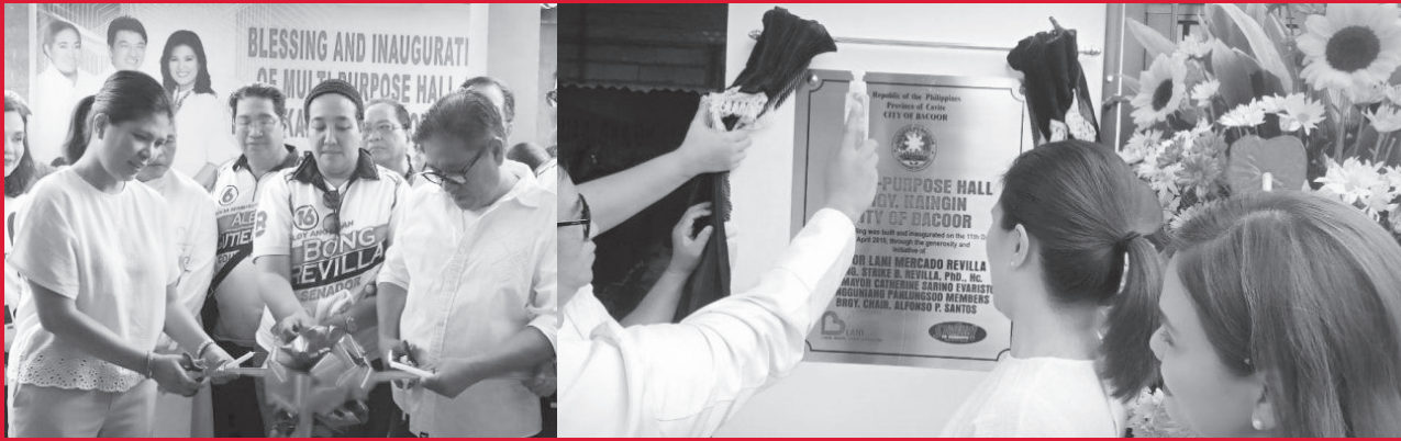
Bacoor City Mayor Lani Mercado Revilla recently led the blessing and inauguration of the multi-purpose hall in Barangay Kaingen. This gives the barangay a space for community events and activities.