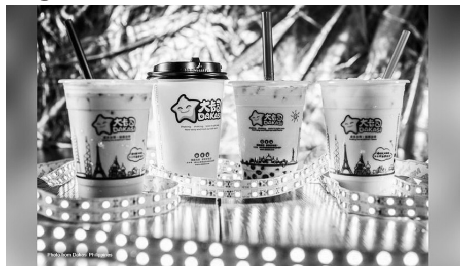
Dakasi Tea crowd favorites

SM CITY BACCOOR, CAVITE - There's more reason to visit SM City Bacoor as Dakasi Tea recently opened its newest store at the mall's 2nd Floor. Milk tea lovers can now enjoy their favorite Dakasi Tea thirst-quenchers with its signature Taiwan milk tea blends with medium-sized yummy pearls. Don't miss trying their Dakasi Bubble Milk Tea, a classic blend that offers a distinctive