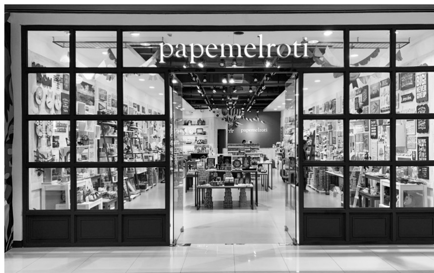
Papemelroti at SM City Bacoor Lower Ground Floor

taste most people describes as "a taste only Dakasi tea can offer." Try and taste their Charcoal Roasted Milk Tea if you're longing for a tea with a hint of coffee. Their Taro Milk Tea is also a must-try for a rich and flavorful taro blend that would definitely capture your heart (and your mother too!). All these and more at Dakasi Tea-SM City Bacoor. Enjoy!