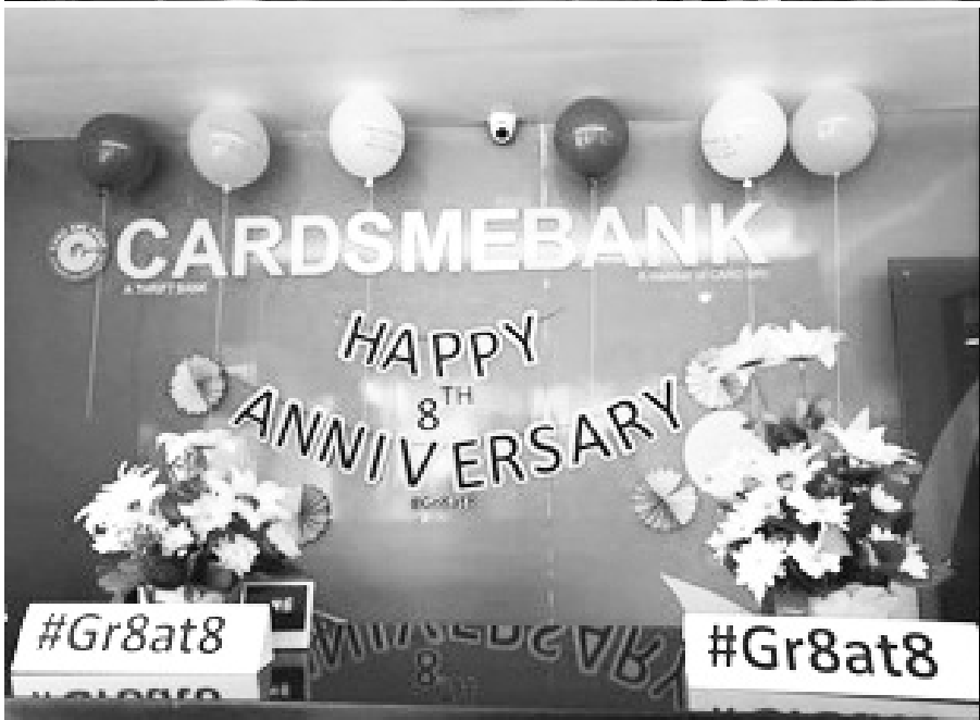
CARD SME Bank, the thrift bank of CARD Mutually Reinforcing Institution (CARD MRI), is now on its 8th year of providing financial and non-financial services to thousands of clients nationwide.

CARD SME Bank clients and employees simultaneously gathered in every branch in celebration of its 8th year anniversary on July 25, 2019.