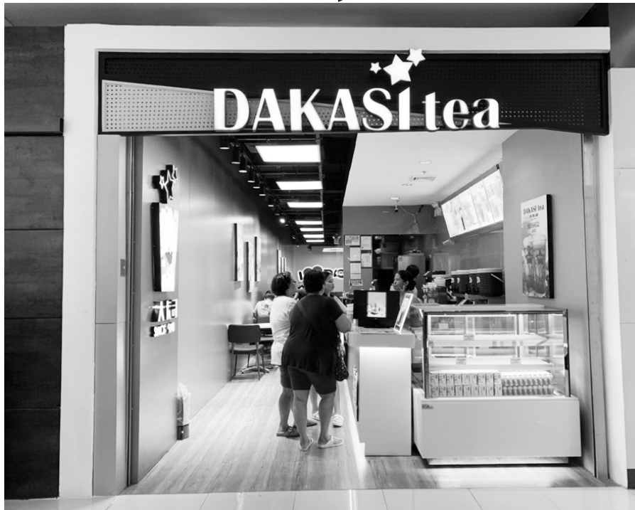
Dakasi Tea at SM City Bacoor 2nd Floor