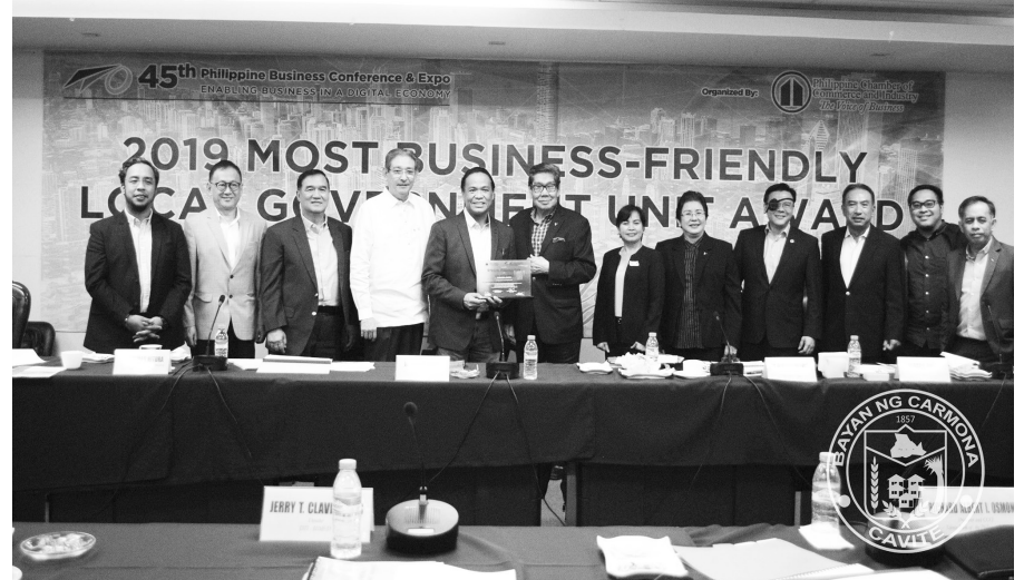
Carmona receives Business-friendly Special Recognition from PCCI: The local government of Carmona received a plaque of Special Recognition for being a finalist of the 2019 Most Business-friendly Local Government Unit Award Municipal Level 1 Category during the Final Screening last October 5, 2019 held at the Commerce and Industry Plaza, McKinley Hill, Taguig City. This is also to acknowledge Carmona's commendable initiatives towards good governance reforms that promote trade and investments that significantly contribute to its local economic development. During the final judging of the award, Carmona presented a 5-minute video highlighting how the municipality fast-tracked sustainable local economic development, improved the ease of doing business, identified their investment promotion initiatives, and listed their initiatives to enhance industry or sectoral competitiveness.