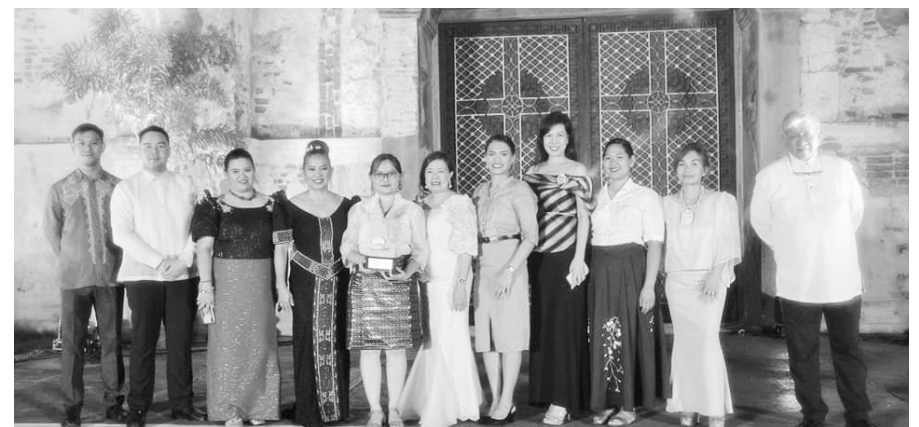
ATOP-DOT Pearl Awards 2019 recognizes Carmona's SORTEO Festival: Carmona's SORTEO Festival won the First Runner-up Award for the Contemporary / Non-traditional Category at the 2019 Association of Tourism Officers of the Philippines-Department of Tourism (ATOP-DOT) Pearl Awards Night held on October 5, 2019 at the Paoay Church, Ilocos Norte, as part of the ATOP 20th National Convention. The Municipal Government of Carmona nominated SORTEO Festival under the Contemporary / Non-traditional Expression as it exhibits a one-of-a-kind tradition that can only be found in Carmona, Cavite. The SORTEO Festival showcases Carmona's tradition of conducting a lottery of communal agricultural lands called the SORTEO ng Bukid ng Bayan done every three years since its separation from Silang, Cavite in 1857. Unlike the other festivals in the Philippines which celebrate their bountiful harvest or honors the pa-