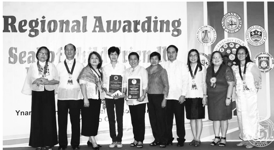
Carmona bags two awards recognizing its Child-friendly programs: On October 3, 2019, the Municipality of Carmona received the Seal of Child-friendly Local Governance from the Department of Interior and Local Government, Department of Social Welfare and Development, and Council for the Welfare of Children during the Regional Awarding. This is based from the results of the 2018 Child-friendly Local Government Audit where Carmona passed with flying colors. Moreover, Carmona was also presented as the Regional Winner of the 2018 Presidential Award for Child-friendly Municipalities and Cities