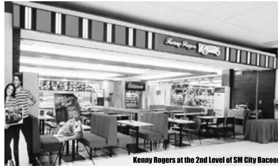
Kenny Rogers at the 2nd Level of SM City Bacoor

SM CITY BACOOR, CAVITE - In their mission to bring food and love in one plate, Kenny Rogers took a step up in launching their new and improved store at the 2nd Level SM City Bacoor to give everyone