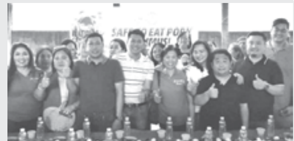
PORK IN IMUS CITY, ASF-FREE. Imus city mayor Emmanuel Maliksi (center, in yellow shirt) assures the public that the pork sold in the city is safe to eat as they remain African swine fever (ASF) free. Maliksi led city officials and the public in a boodle fight with pork-based dishes like longganisa (pork sausage) and lechon (roast pig) at the city public market on Friday (Oct. 4). Story on page 3