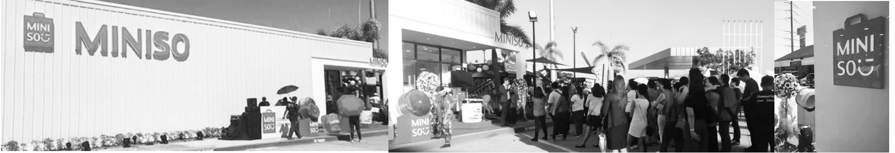
Shared snaps of Miniso, a Japanese brand retailer on their newest store opening ceremony recently at Total SLEX Northbound in Sta. Rosa, City Laguna. See story on Page 6