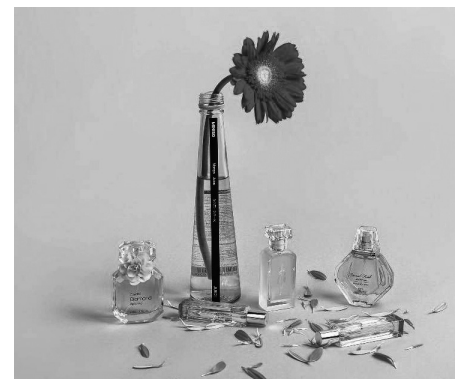
Miniso's delightful body and home fragrance collection.