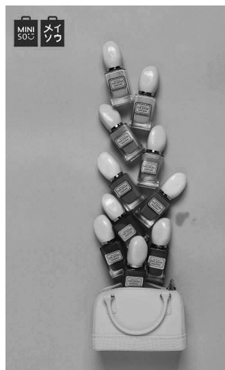
Bring some art to your fingertips with Miniso nail polish

To date, it has opened more than 2,100 stores around the world- United States, Canada, Russia, Singapore, Brazil, Saudi Arabia, the United