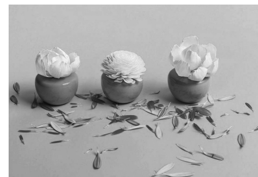
Fill your room with the refreshing and natural fragrance of Miniso's flower aroma diffuser

Arab Emirates, Turkey, South Africa, Korea, Malaysia, Thailand and the Philippines.