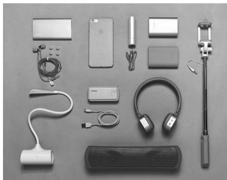
Miniso brings style to tech gadgets and accessories like earphones, speakers, power banks, cables, selfie sticks, desk lamps and many more.