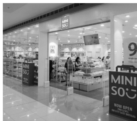
Japanese brand Miniso is not only a brand, but a way of life with its variety of beauty, fashion, home, tech products and other delightful Japanese finds.