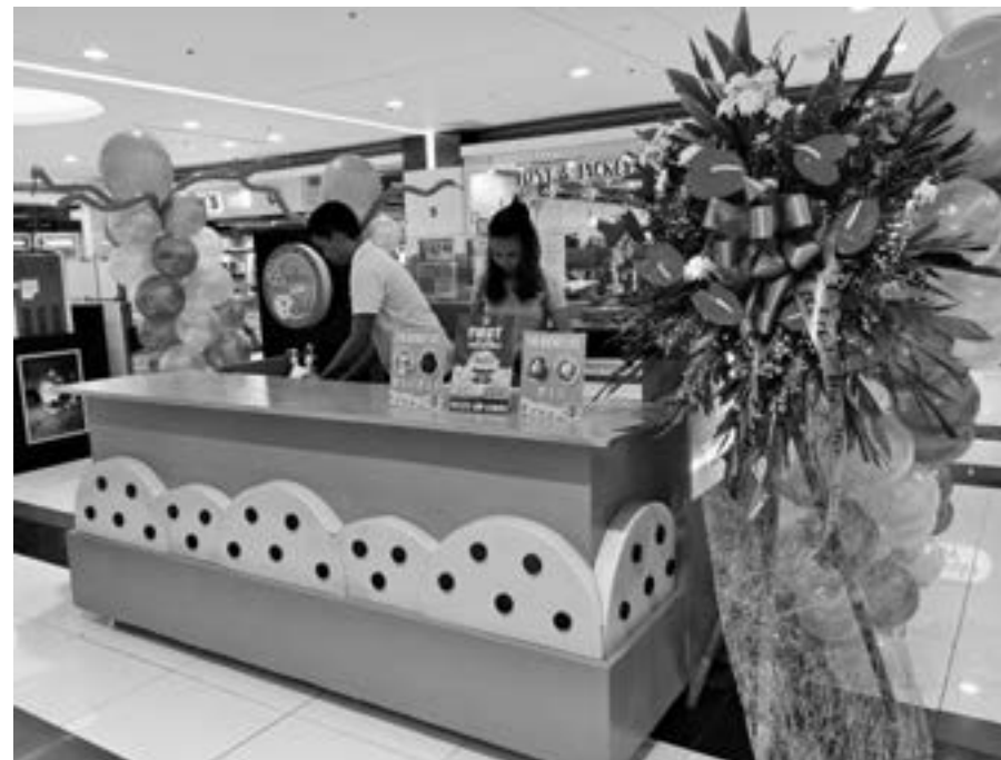
Cookies By The Bucket at 2nd Level of SM City Bacoor