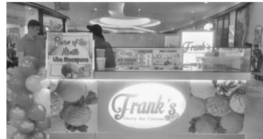
Frank's Dirty Ice Cream at SM Molino 2nd Level