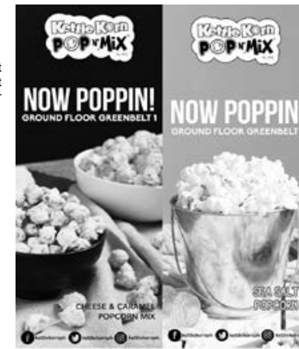
Frank's Dirty Ice Cream at SM Molino 2nd Level