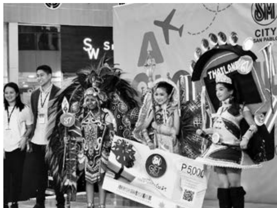
Photo caption as: The UN 2019 Costume Contest is where mall goers can view the colorful displays of flags from various countries while enjoying songs and dances around the world. Be sure to celebrate United Nations Day here at SM City San Pablo and witness at the colorful colors of the world with the UN National Costume Contest parade! This activity is to celebrate the friendship that the nations have built and to show appreciation for the diverse culture each country has.