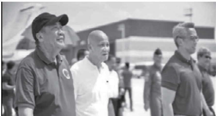
SANGLEY AIRPORT DRY RUN. Department of Transportation (DOTr) Secretary Arthur Tugade (left), Cavite Governor Jonvic Remulla (right) and Cavite City Mayor Bernardo Paredes (center) witness the operational test run of the Cebu Pacific cargo plane flight at Sangley Point Airport in Barangay San Antonio, Cavite City on Oct. 29, 2019. The officials likewise inspected the airport facilities.