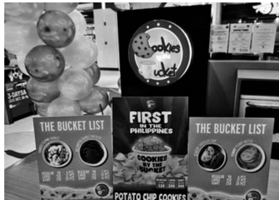
Great Choices at Cookies By The Bucket

SM CITY BACCOOR, CAVITE - Milk and Cookies are definitely inseparable and the most sought after merienda kids are longing after a tiring playtime under the sun. Don't you miss your mom's incredibly tasty cookie recipe? Well it's good to know that even after work or just a fine afternoon at the mall, we can grab our favorite cookies and dunk them in a cold creamy milk in no hassle. Cookies By The Bucket at SM City Bacoor is now ready to serve you the best cookie and milk duo in town! Fill your buckets with warm freshly baked potato chip cookies served with milk in regular, large, giant or monster bucket! Be on hype with their Delightful Double Chocolate Cookies, Classic Chocolate Chip or Yummy Peanut Butter Cookies! Craving now? Well there's more. Your all-time favorite Famous Filipino Crinkles are also available. So hurry and enjoy Cookies By the Bucket at SM City Bacoor 2nd Floor!