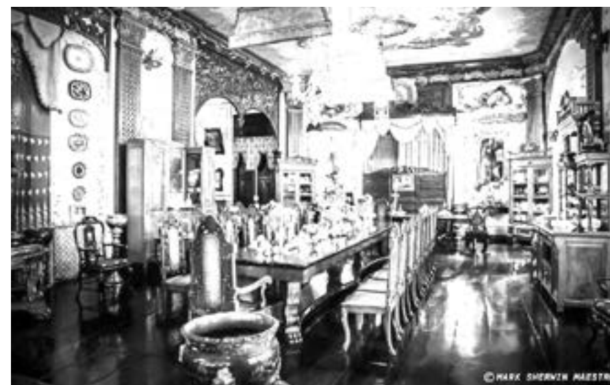
Museo De La Salle

mation, introduce newly opened tenants' stores, present new projects or services of tenants, government agencies, LGUs, private organizations and SM.It invites members of the national and local media, bloggers and other social media influencers to create an avenue for maximum media exposure.