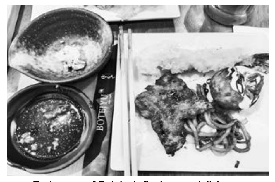
Taste more of Botejyu's finely served dishes

Craving for japanese food? Now, you can have an authentic japanese dining experience, and taste the real goodness of freshly made dishes in the newest store in the South! Located at the Upper Ground Floor of SM City Bacoor, Botejyu is ready to take you to the finest cuisines of Japanese towns and cities, serving the freshest meal each of them has to offer with over 60 dishes on their menu. Try their Edo-styled Shrimp Tempura Sushi Roll covered in neatly prepared fresh fish roe, best shared with its larger serving. If you can't decide whether to order a spicy or salty and garlicky takoyaki, try their Takoyaki All Star so you can get six of the best flavored Takoyaki in town. Of course, you wouldn't want to miss Botejyu's signature Okonomiyaki which is served with their original Secret White Mayonnaise. Hungry yet? Come now at Botejyu-SM City Bacoor located at the Upper Ground floor.