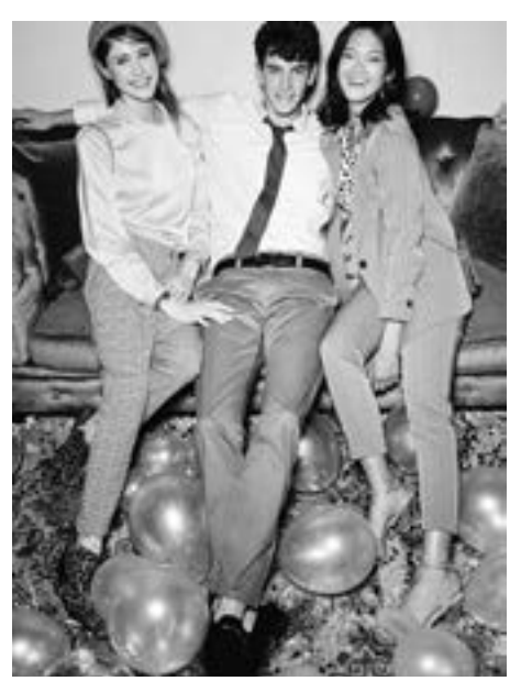
Check-in the fun with pieces perfect for office holiday parties, all available at The SM Store.