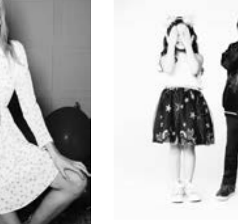
Take a pause from the dance floor and pose for the camera. Shop this look at The SM Storea long-sleeved Floral Dress, Yadid Boots and Sling Bag with Gold Studs.