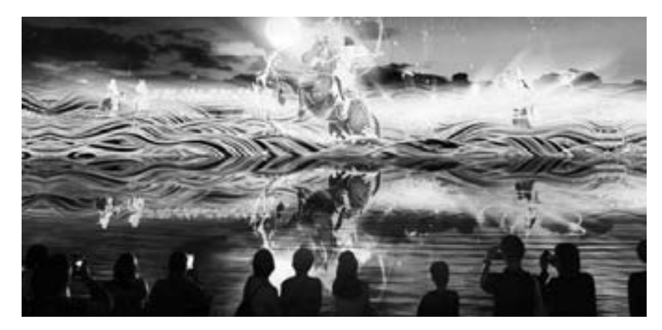
Water Scrolls: Genpei Yashima Battle (artist rendering)

As a special treat for a clients ,Sun Life will hold a special event where they can view the show for an exclusive venue where