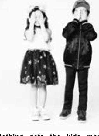
Nothing gets the kids more excited than unwrapping the goodies under the tree. They're dressed in holiday style - in a shimmery halter top and tulle skirt with glittered embroidery for her and a bomber jacket and pants on him