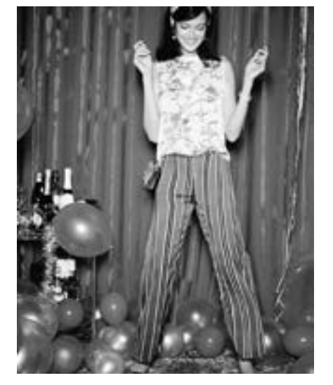
Bag the Christmas party best-dressed award with this print-on-print number from The SM St e massive projection spans a total of 100 meters e massive