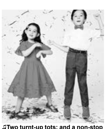
Christmas party! ☐ They're ready to dance in a red ruffle-sleeved eyelet dress and glittered pumps for her and a short sleeved button down polo and woven pants for