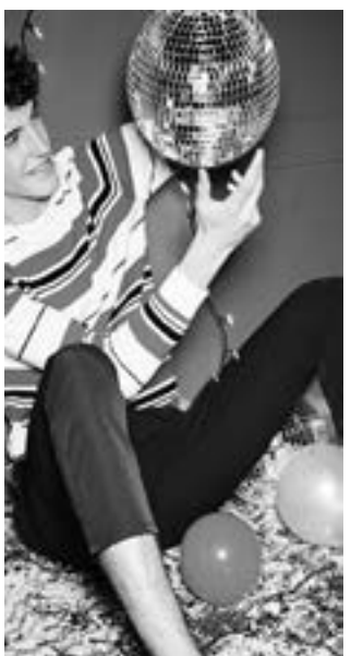
weather season #ltsChristmasatSM