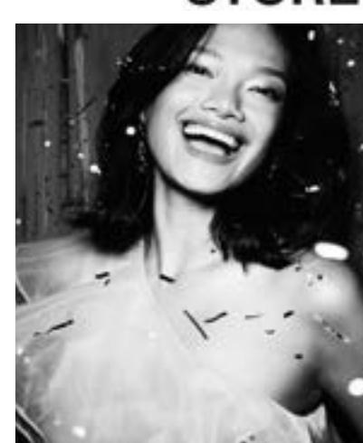
Razzle and dazzle this Christmas with the latest holiday collection available at The SM Store like this asymmetrical ruffled top. #ItsChristmasatSM