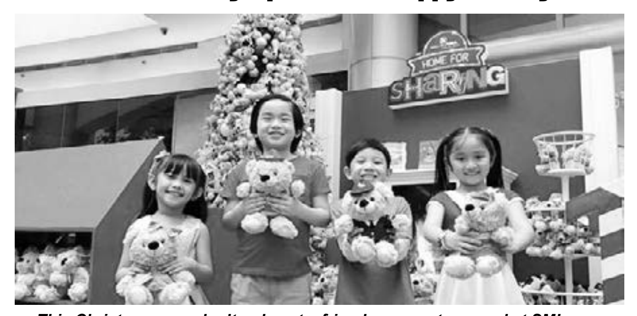
This Christmas, you don't only get a friend – you get a squad at SM!

In celebration of "Happy Bear Day" this December on-ground celebration dedicated to inviting fami-1, SM Supermalls brings a merrier holiday celebration as it introduces the all-new 2019 Joy Squad elevating the fun, excitement, and spirit of joy this season of giving, especially among kiddie shoppers, in SM malls nationwide!