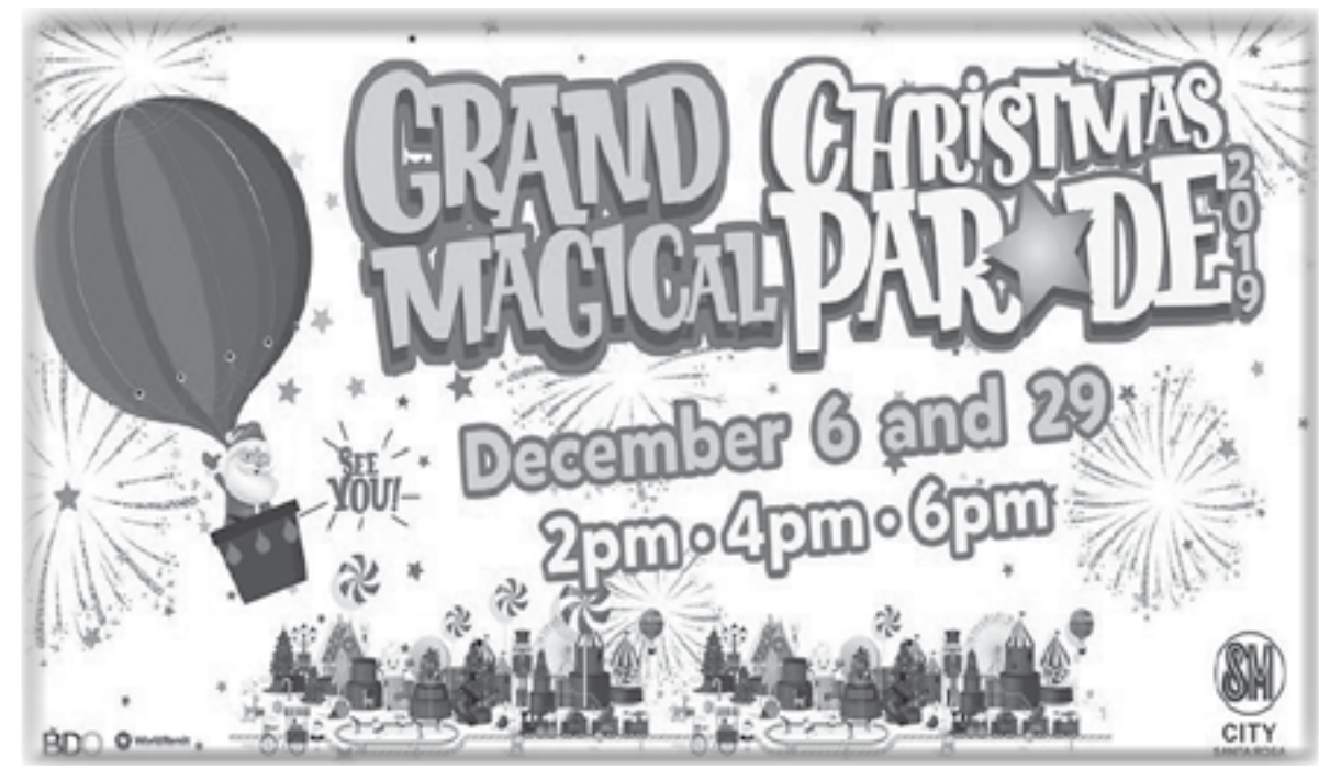
SM Santa Rosa's Magical Christmas Parade. Let us all celebrate a #SparklingSMallidays with your favorite Christmas Parade Characters and Mascots on December 6 & 29, 2019 at SM City Santa Rosa! Get up close and personal with our lovable characters by securing reserved seats for every purchase of Bears of Joy worth P200. 1 pair will get you 2 seats!

"Let's not wait for another patient to be confined, or even worse die, as a result of EVALI. It's time to regulate these smoking devices and save the lives of many Filipinos, particularly the youth," he said.