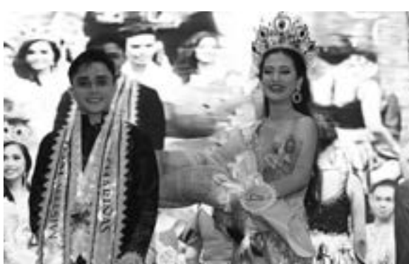
lined up on stage for the 1st Set of Special Awards. First set of Special Award recipients received cash prize, lei, bouquet and sash from the corresponding sponsors and special awards:

flows continuously, the candidates came out on the stage with their sportswear that showcased different kinds of sports. Followed by the casual segment. After they modeled their chosen fashion wear, all the candidates