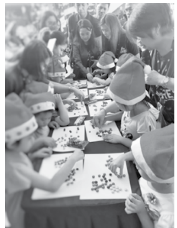
Kids from City Homes Daycare Center playing color game with SM City Molino's Volunteers