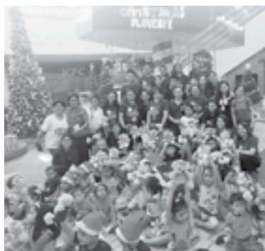
Volunteers from SM City Molino making this season merrier as they hand out Bears Of Joy to the kids