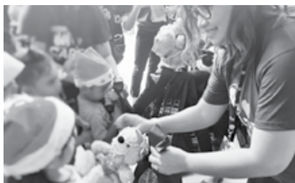
SM City Molino Volunteers Playing with the kids during the event