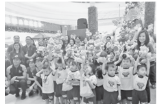
Children from Panapaan 5, Day Care Center, Bacoor City with their new cuddly friends SM Bears of Joy, and the volunteers from SM City Bacoor