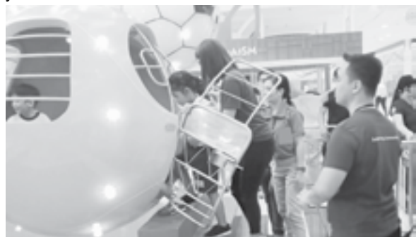
Kids enjoying the rides at SM City Bacoor's Storyland Orbiter

Christmas is indeed merrier when people are freely giving and is filling the season with love, smiles and laughter. Thanks to the Malasakit of SM City Bacoor and SM City Molino's shoppers who bought and donated SM Bears of Joy, and their Employee Volunteers who served as this year's Christmas Elves. Surely, these children will be going home with lasting smiles with this year's ChriSMiles!