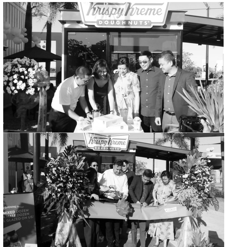
Snap photos of the RIBBON CUTTING and MOA signing in Krispy Kreme doughnuts recently at TOTAL SLEX IN STA. ROSA LAGUNA right beside on the newly-opened MINISO.

The Provincial Advisory Committee (PAC) thru the Provincial Social Welfare and Development Office in coordination with the Department of Social Welfare and Development Office (DSWD) IV – A, held a Lakbay Aral to DSWD implemented programs and services in the localities of Magallanes and Alfonso, Cavite on April 24, 2019. The objective of the activity is to provide learnings on the implementation of anti-poverty programs of DSWD to Pantawid beneficiaries in the abovementioned municipalities. Among the areas visited in Magallanes were the Kabulusan Community Store, with 24 members; San Sebastian Hog-Raising Project with 24 members; Baliwag Community Store with 25 members; Pacheco Water Refilling Station with 65 members and Bigasan sa Pacheco with 24 members. The team also visited the Angat Kababaihan ng Alfonso in Brgy. Taywanak Ilaya, Alfonso, Cavite with 46 members. The said cluster is under the Sustainable Livelihood Program (SLP) project of the DSWD. The tour was participated by almost 30 individuals from the different offices of the Provincial Government of Cavite, DepEd, DSWD IV-A and the LGUs of Magallanes and Alfonso. (Amelia C. Cabrera)