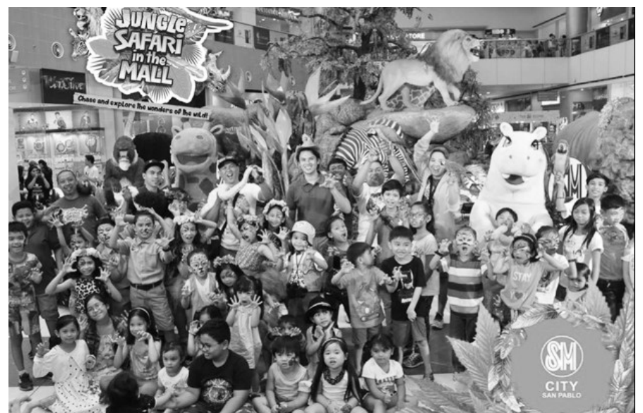
Photo caption as Jungle Safari in the mall let me hear you "Roar". Enjoy one of a kind exhibit as SM City San Pablo brings you closer to the wild. Exhibit Runs until May 17, 2019.

All are welcome to explore as the Jungle Safari is free admission. Experience a different kind of summer adventure in the city at the Jungle Safari only at SM City San Pablo.