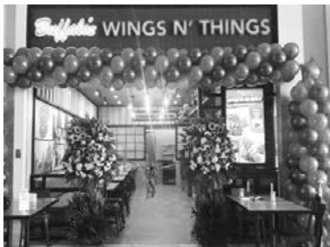
Experience the heat at Buffalo's Wings N' Things