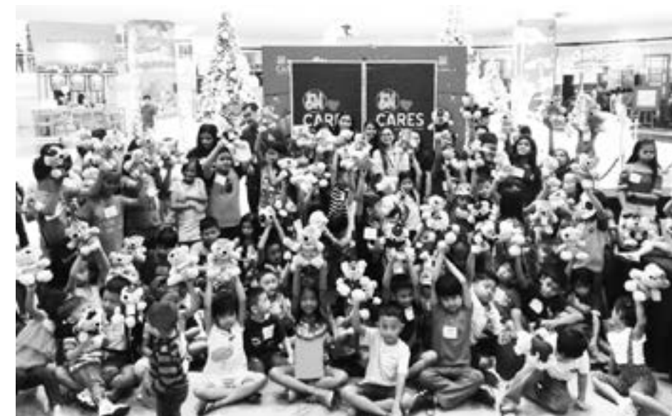
Children were very excited to play with their new SM Bears of Joy.