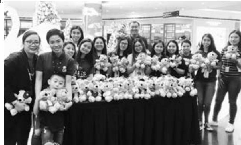
SM City Dasmaringas employees happily volunteered to SM ChriSMiles and excited to give the SM Bears of joy!