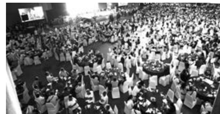
Almost 1,500 happy guests filled the entire Reception Hall of the PICC