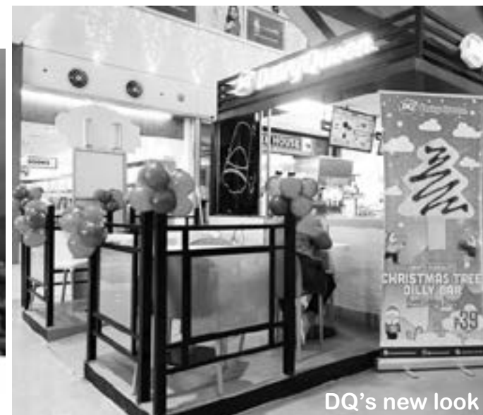
DQ's new look