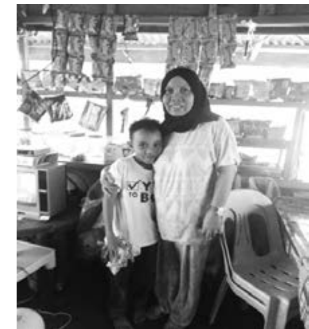
child's dream – a dream not only for himself, but for their community, as well.