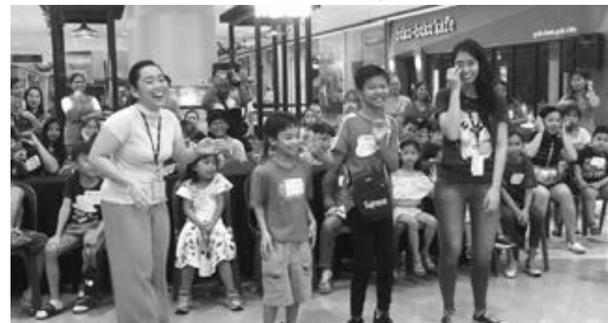
Fun games were held to make the event more fun and exciting.