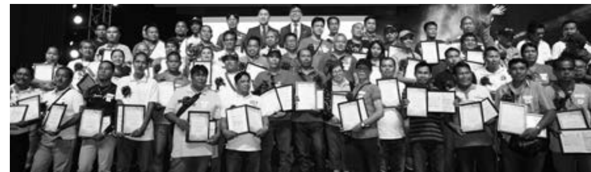
The proud graduates of the 6th ceremony towards a successful future in the Philippines

(In photo: GMS staff with one of the proud graduates who has successfully paid off his tricycle loan)