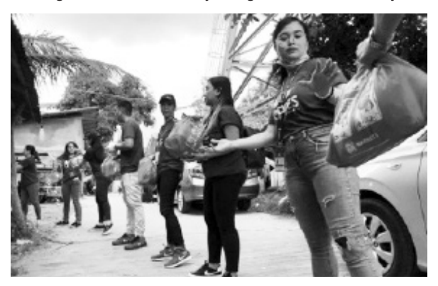
SM City Trece Martires and SM City Rosario volunteers give time and effort to reach out the victims of Taal Volcano eruption.

SM Supermalls South 2 Region - SM City Trece Martires and SM City Rosario sent relief goods to the Taal Volcano evacuees in Alfonso and Mendez Cavite on Saturday through the project Operation Tulong Express (OPTE). Almost 700 families who evacuated from Batangas were reached by the goods distributed by the