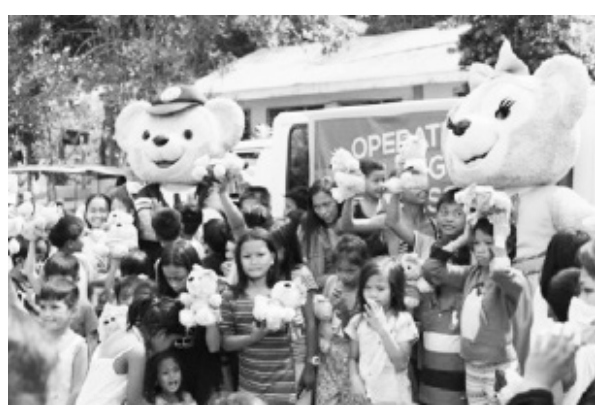
SM Bear Mascots join the Operation Tulong Express to give SM Bears of Joy to the children of evacuation center in Alfonso Cavite.

The Operation Tulong Express (OPTE) shall continue to the next few days to reach more families affected by the