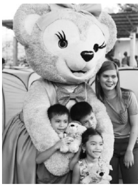
SM Bears of Joy embedded smile on the children's faces.

The project OPTE is one of the first responders during lamities which gives immediate assistance to communities in form of giving basic needs. The eco bags also called as Kalinga Packs, consist of bottled mineral water, rice, ready-to-eat meals and instant noodles in a timely manner and free of contamination. Also through this project, the Malls were able to give SM Bears of Joy to the affected children to give joy and ease from a tragic experience caused by the