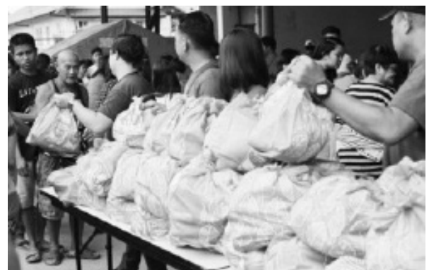
Kalinga Packs consist of ready-to-eat food which