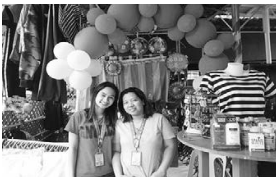
Shaping young minds as future entrepreneurs. CARD-MRI Development Institute, Inc. (CMDI) Bay Campus held an activity that would help its BS En-

trepreneurship students to fine-tune their entrepreneurial mindset. This is a regular activity of the school to mold its students to help them become effective entrepreneurs. The activity showcases different products like clothes and food among others from different parts of the country. It also trains the skills of the students in marketing and selling their products by applying the lessons they learned in their entrepreneurship classes. Other activities of the event includes singing contest, cooking contest, and food carving.