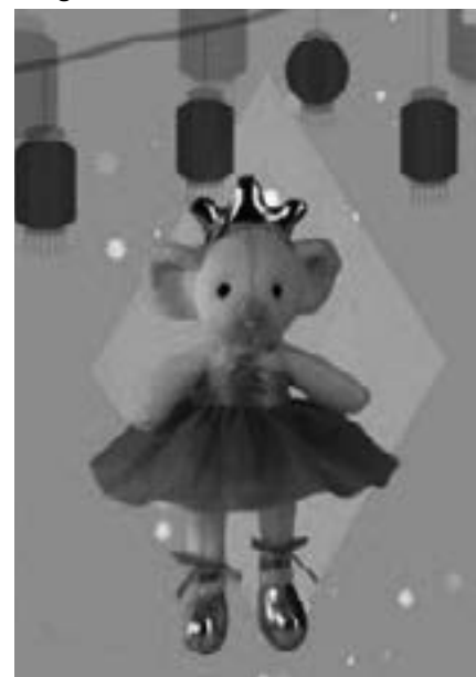
Pastel colored rat plush toy from Toy Kingdom for more charm and luck.