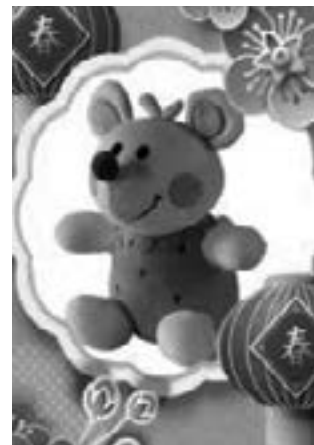
Huggable and fluffy hamster inspired plush toys to keep you company this Year of the Rat. Available at Miniso.