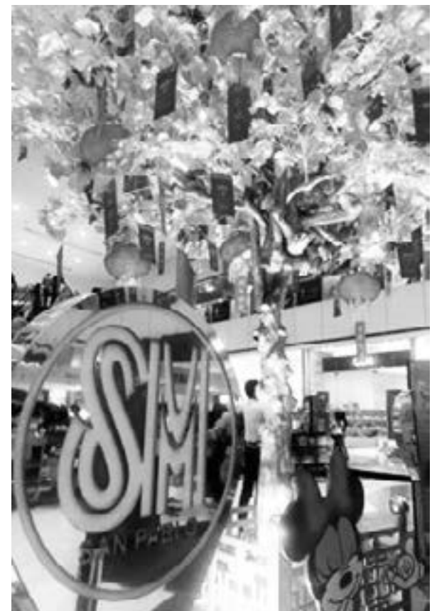
Its Minnie and Mickey for SM City San Pablo's money tree photo opp area bringing luck to anyone who will take photos in the mall atrium. Kung Hei Fat Choy.