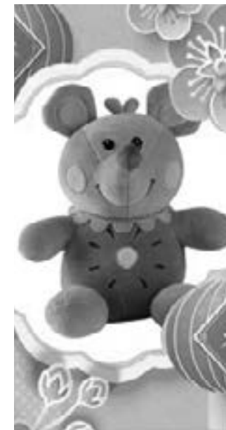
Cuddle this Kiwi rat plush toy from SM Accessories Kids this Chinese New Year.