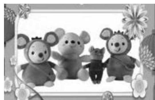
The cutest rat colony from SM Accessories Kids. Available in SM Accessories Kids department of The SM Store.