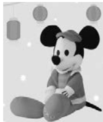
Bring home this classic Mickey Mouse plush toy for more luck in the Year of the Rat. Available at Toy Kingdom.