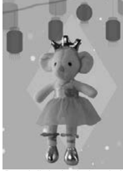
Pretty ballerina inspired rat plush toy. Available at Toy Kingdom.