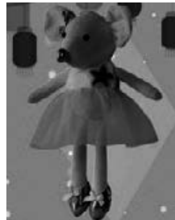
Keep the luck all - round with this pink rat plush toy from Toy Kingdom.