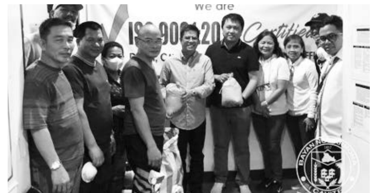
Carmona LGU and NGOs donate to Taal victims: The Masonic District Region 4 Cavite East GLP F&AM and the Rotary Club of Carmona Cavite, together with the municipal government of Carmona, donated relief goods to the affected citizens of the Taal volcanic eruption on January 16, 2020.

donations from other government agencies, private groups and individuals continue to pour in which will also be delivered to the affected families.