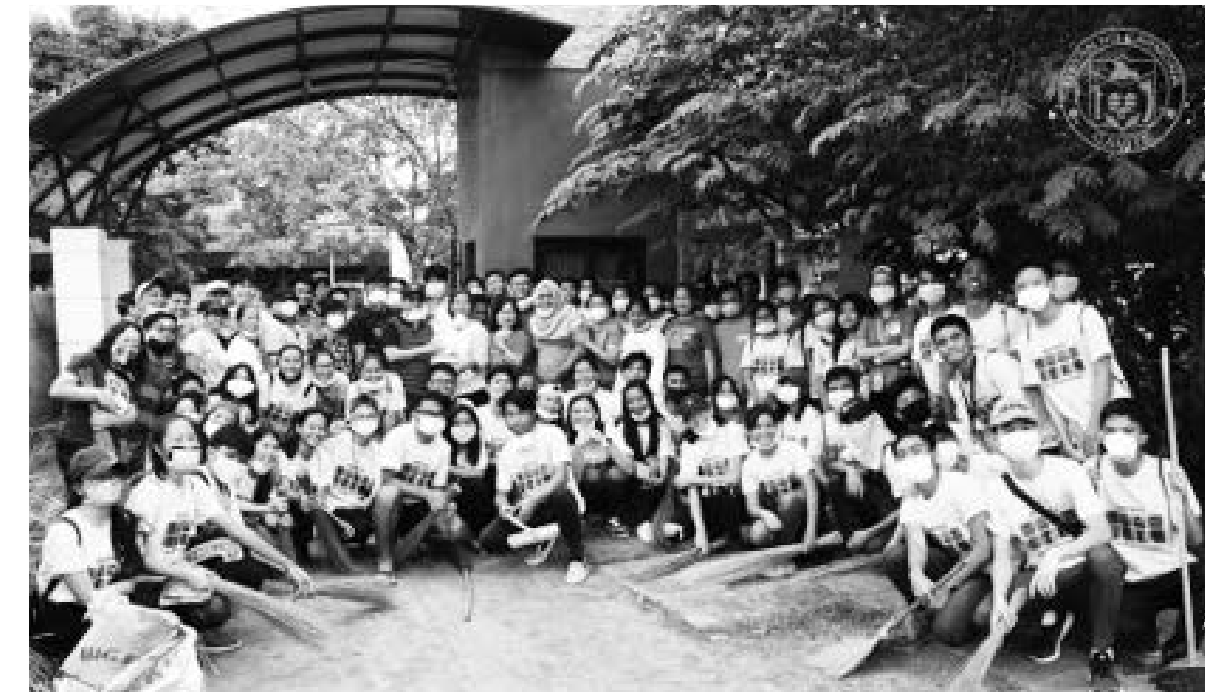
Carmona LGU distributes face masks to public schools: To help decrease the negative effects of the ashfall to the health of the residents, the Municipal Government of Carmona distributed boxes of face masks to public schools in Carmona on January 14, 2020 during the massive clean-up operations held in schools.

All the cities and municipalities were covered in the four-day relief operations initially serving a total of 6, 424 affected families from Batangas. The activity will continue to serve more families in the coming days. Aside from the relief goods from the provincial government,