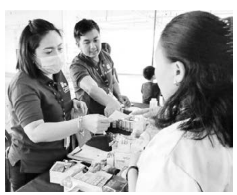
Beneficiaries were grateful of the free medicines given as prescribed by their respective doctor after the medical consultation

SM Foundation is the heart of SM group of companies focused on social inclusion by nurturing and caring for underserved communities where SM is present. SMFI is committed to serve by supporting and empowering SM host communities through education, healthcare, shelter, disaster response, farmers' training, environmental programs and care for persons with special needs.