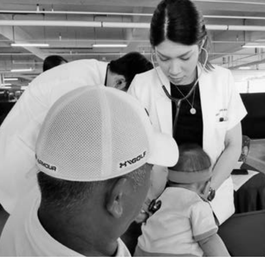
Volunteer doctor checking a baby who has been suffering from Asthma. The eficiary has been given proper medical attention and medication after.