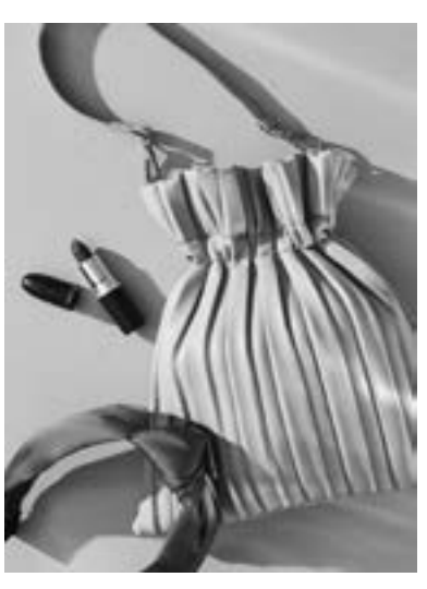
For the girl who loves her basics, stick to something classic - SM Accessories bag and headband, and MAC Matte Linstick in Chili.