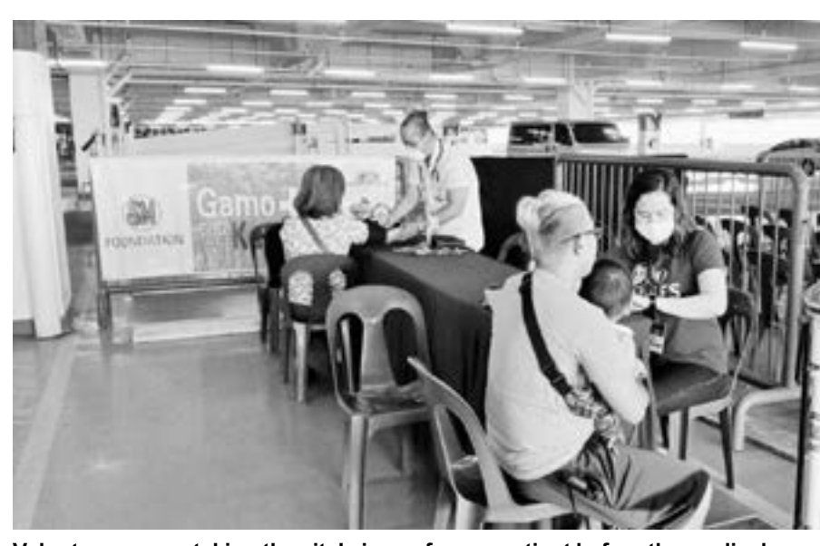
Volunteer nurses taking the vital signs of every patient before the medical con-