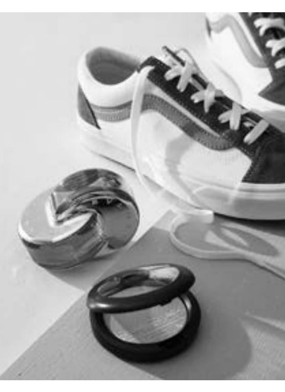
Athleisure glam. Vans Retro Sport Style Sneakers, Bylgari Omnia Amethyste Eau de Toilette, and MAC Extra Dimension Skin Finish in Double Gleam. Check them out at The SM Store today.