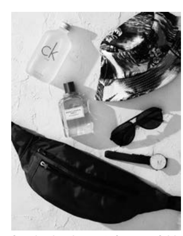
Casual and cool presents for guys - Calvin Klein CK One Eau de Toilette, SM Accessories Bucket Hat, Sunnies Studio Sunglasses, Kenneth Cole Classic Watch, SM Accessories Belt Bag, and Givenchy Gentleman Only Eau de Toilette.

Visit The SM Store today and share the love this Valentine. Follow The SM Store on Facebook, Instagram, and Twitter.