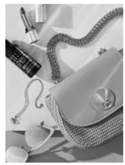
The blush brigade: SM Acces-Foundation, and Dear Dahlia now. Lip Paradise Intense Satin Lipstick from The SM Store.