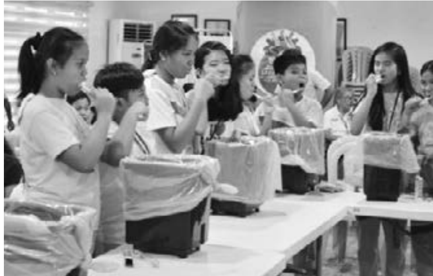
Carmona celebrates National Oral Health Month: As National Oral Health Month is held during February, the Carmona Municipal Health Office (MHO) spearheaded the celebration on February 21, 2020 where 135 beneficiaries were taught on how to properly take care of their teeth as well as the proper way to brush teeth. The Carmona MHO distributed dental kits containing a toothbrush, toothpaste, towel, and tumbler. ROHM Electronics Philippines, Inc. also distributed face towels and soap to the participants of the event.