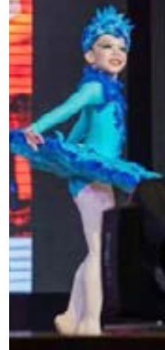
Wearing national costume after the competition on Feb 17 2020 held in Melaka, Malaysia