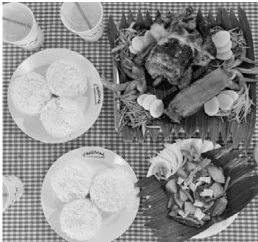
The best dishes are best shared! Come and visit Baliwag Lechon Manok Atbp at SM City Bacor Food Court located at the 4th Floor!