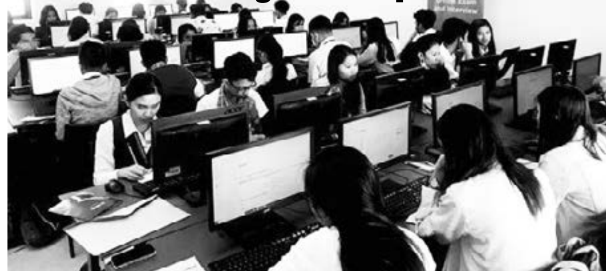
Laguna Grade 12 students who applied for the SM Scholarship Exam took their online exam in the newly built NU Laguna Campus, those who will pass will be notified with a house visit from SMFI.

SM being the country's largest conglomerate with businesses in retail, property, banking and more have been supporting the Filipino youth to reach for their goals through its SM Foundation College Scholarship Program. SM Foundation provides not only an access to quality education, but also enables the potential of the scholar.