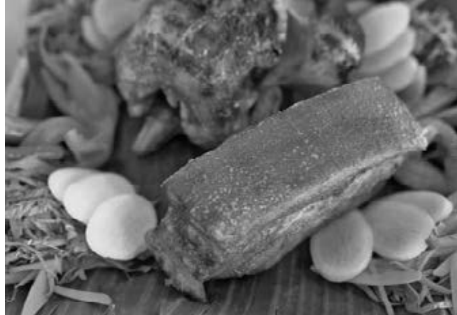
Baliwag's Lechon Manok and Liempo, flavored and roasted to suit your Filipino taste

SM CITY BACOR, CAVITE – Bring the whole family and enjoy Baliwag's Famous Filipino Dishes served fresh and tasty! Enjoy the famous Baliwag Lechon Manok and dine with your friends and family as you savor the taste of freshly roast chicken served hot and savory! Share every bite of their roasted chicken and their crispy Liempo, best with rice, drinks, and good stories to share at your favorite Food Court spot. You may also try their delectable Sinigang na ulo sa miso for the whole family! They also have a lot of options so you won't need to worry about serving different flavors as if you're all at home. All these and more at Baliwag Lechon Manok Atbp. At SM City Bacor –Food Court located at the 4th floor!