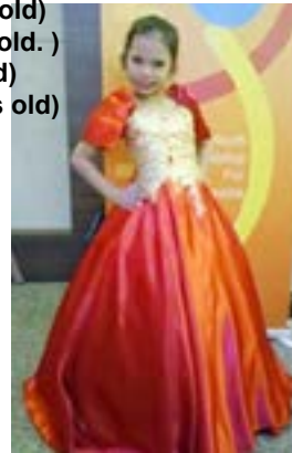
Philippines representative from Dance Factory School of Classical and Modern Jazz inc. For Asia Pacific Arts Festival held in Melaka, Malaysia last February 15-17, 2020