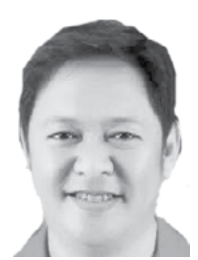
VICE MAYOR JOSE VOLTAIRE V. RICAFRENTE

The National Nutrition Council – CaLaBaRZon joins the 2020 National Women's Month Celebration