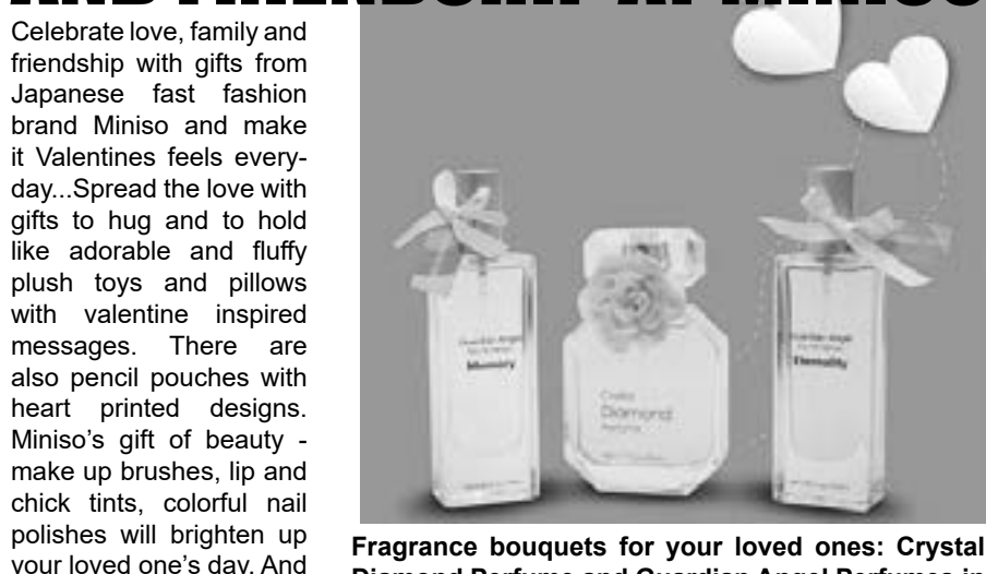
Diamond Perfume and Guardian Angel Perfumes in Memory and Eternality scents.

located at the 3rd level people come back for cakes are baked on-site, CELEBRATING LOVE, FAMILY AND FRIENDSHIP AT MINI