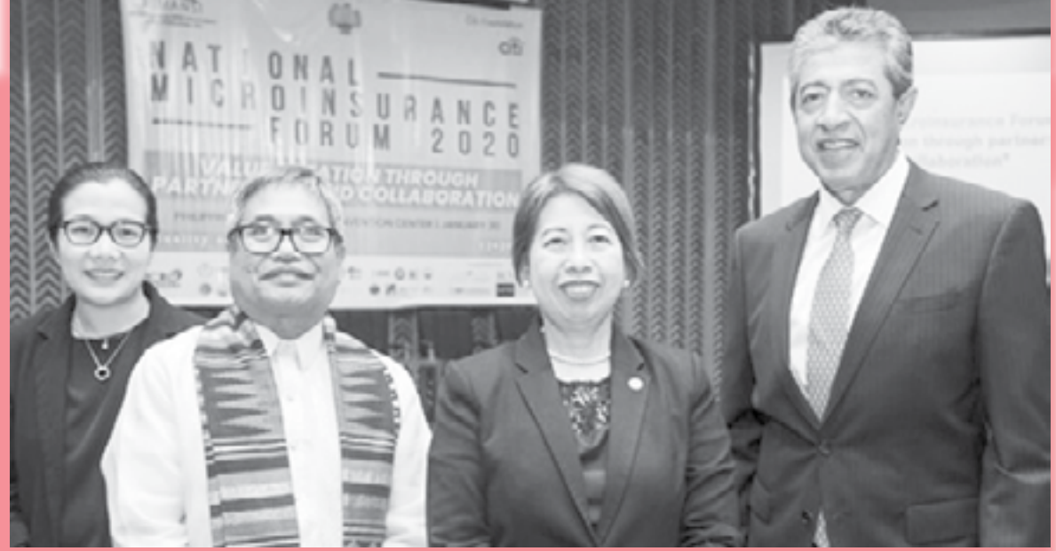
ship and collaboration in product development, utilizing digital financial services, as well as promoting good governance practices

Also discussed were opportunities for partner-