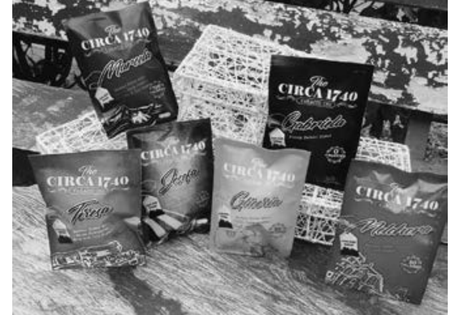
Circa 1740 uses a variety of coffee blends made from Batangas Liberica coffee on their products and is now making a name in the business industry.

The Department of Trade and Industry (DTI) opened the doors to more opportunities giving the company more privileges to enter into a more dynamic business environment. They started joining Kalakal Calabarzon and eventually getting a slot under the Kapatid Mentor Micro Enterprise (KMME) Program and chosen as one of the best Business Plan Presentation