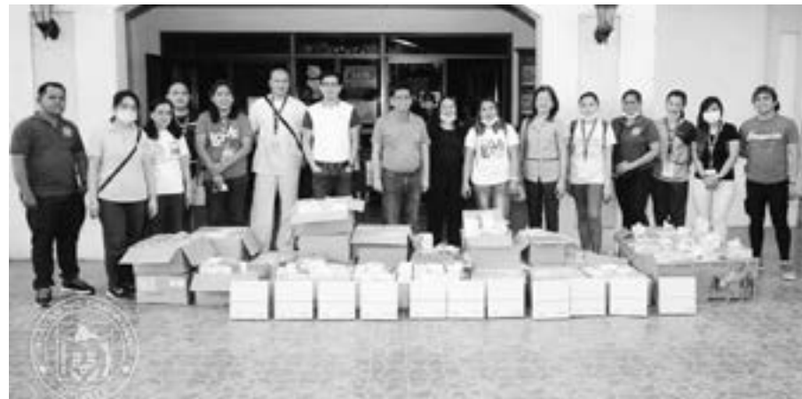
Carmona LGU distributes more health supplies to barangay health centers: On March 19, 2020, the Municipal Government of Carmona handed out medicine, nebulizers, and other medical supplies to strengthen the work force of all Barangay Health Emergency Response Teams (BHERT) and for the barangay health stations to be more equipped.