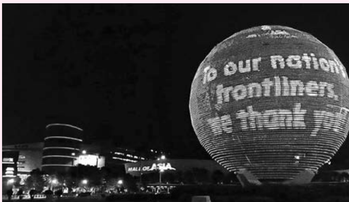
The iconic Mall of Asia Globe lit up as SM Supermalls pays tribute, a salute all our doctors, health professionals, mall frontliners and security force. Thank you for keeping us safe! stay strong!

The SM Group has pledged P100 million for efforts to battle the spread of COVID-19 in the Philippines. advertisement