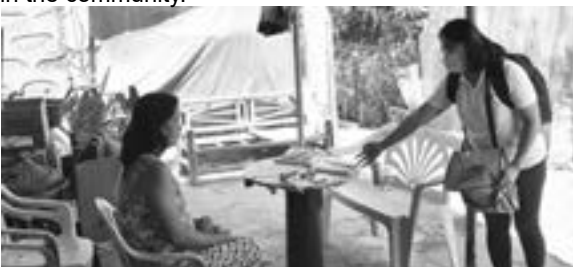
BML Delivery transports maintenance medications to Carmona residents: The Bayan, May Libreng (BML)

Carmona and Biñan join forces for Extreme Enhanced Community Quarantine : On March 26, 2020, the Municipal Government of Carmona and Municipal Government of Biñan released a Joint Inter-Agency Task Force (IATF) Order No. 01-2020 in which "Extreme Enhanced Community Quarantine" will be implemented at Carmona Estates Phase 10 in Biñan, Laguna. This is after the City Health Office of Biñan reported a positive coronavirus disease (COVID-19) case of a patient currently residing at the said location on March 25, 2020 to prevent and control the spread of the virus in the community.