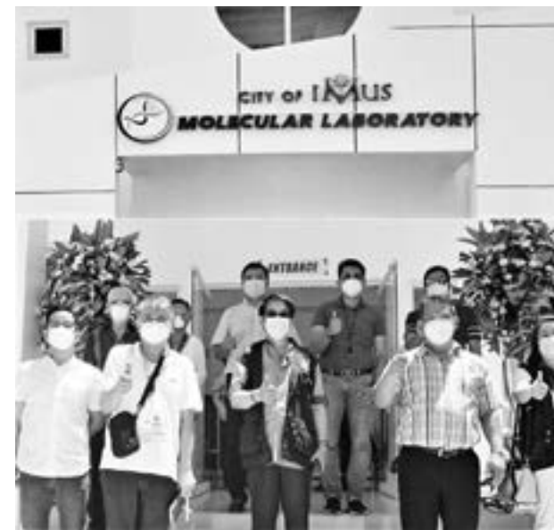
Officials from the DOH-Regional Office led by Regional Director Eduardo C. Janairo (center) and the City Government of Imus led by Mayor Emmanuel L. Maliksi (on blue polo shirt) flashes the thumbs up sign in front of the newly opened Imus Molecular Laboratory which was granted accreditation by the DOH on May 29, 2020. The blessing and opening ceremony was held on June 6, 2020 inside the compound of the Ospital ng Imus in Cavite.

Janairo assured the people of Imus that the regional office will work for the level 3 accreditation of the "Ospital ng Imus" to better serve the health needs of the community and all Cavitenos. (PIA)