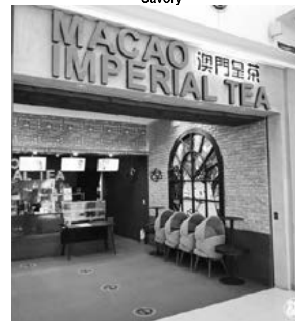
Refreshing drinks from Macao imperial Tea