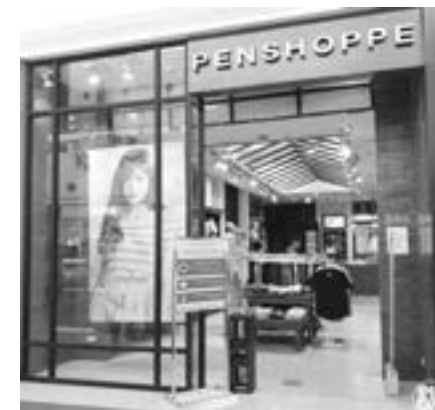
Get the latest fashion from Penshoppe