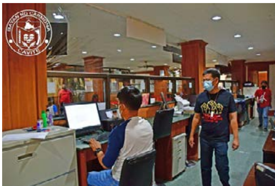
Carmona Mayor Roy Loyola conducts inspection at Municipal Hall: Municipal Mayor Roy Loyola inspected the offices and departments at the Carmona Municipal Hall on June 18, 2020 to ensure that all employees are complying to the health standards being implemented in the workplace during General Community Quarantine.