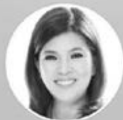
LANI MERCADO-REVILLA Mayor, Bacoor, Cavite