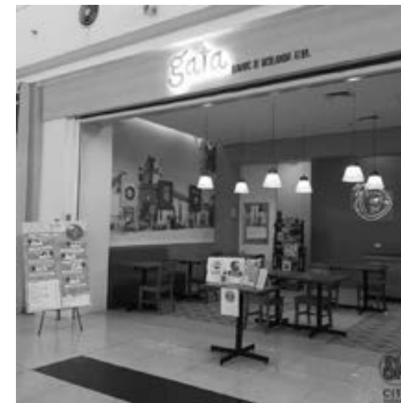
Get authentic Bicolano dishes from Gata Flavors

With the many options of convenience the mall provides, SM City Rosario is only getting started. Ushering a new era of customer experience, the mall will continue to provide safe and efficient solutions for the benefit of its shoppers. For more information on the SM Rosario Center Concierge, follow SM City Rosario on Facebook and Instagram.