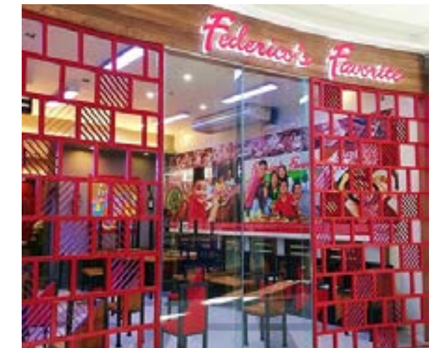
Favorite home dishes from Federico's Favorite