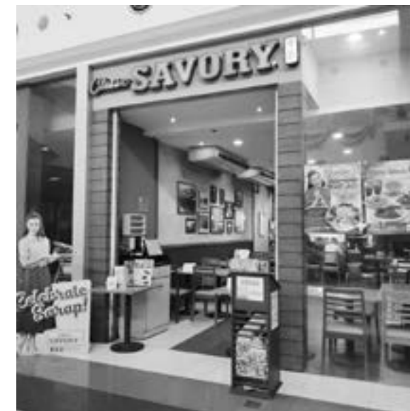
Satisfy your Chinese food cravings at Classic Savory