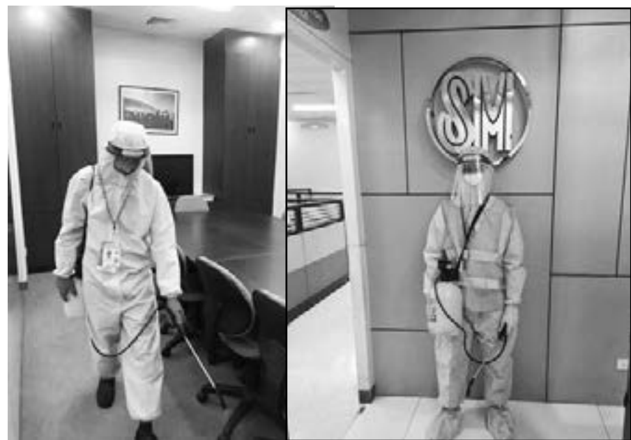
Round the clock Sanitation is being done in SM to ensure the safety of not only its mall patrons but as well as its employees.

Covid-19 has forced companies to change their routines and flex new leadership muscles. Many have risen to the challenge, one company that shows resiliency with a heart is SM Supermalls. It is also becoming clear that there will be no quick return to normal. Filipino workforce face a prolonged period of un-