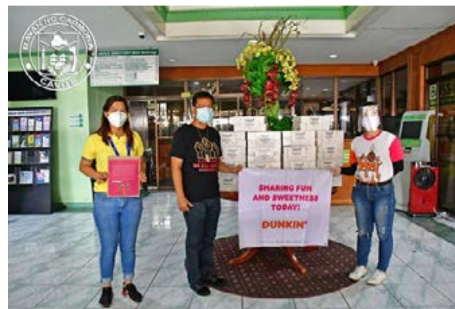
Donors continue the spirit of #BayanihanMunaLagi this COVID-19 season: Donors from the public and private sectors continue to help Carmona frontliners and residents through various donations.