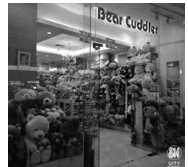
Huggable bears are waiting for you at Bear Cuddler