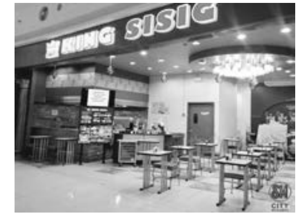
Get irresistible sisig only from the King, King Sisig!