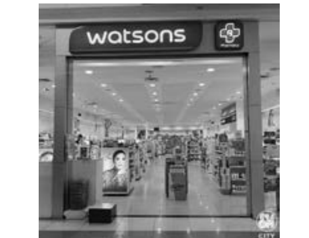
Get your essential self-care from Watsons