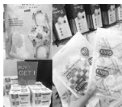
SM City San Pablo's Stylish Masks for the new normal.