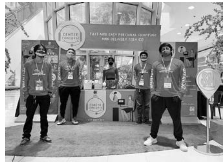
Through SM Laguna Riders program and Quick as a Click personal shopper and delivery service, SM Santa Rosa taps displaced employees as partner delivery riders.