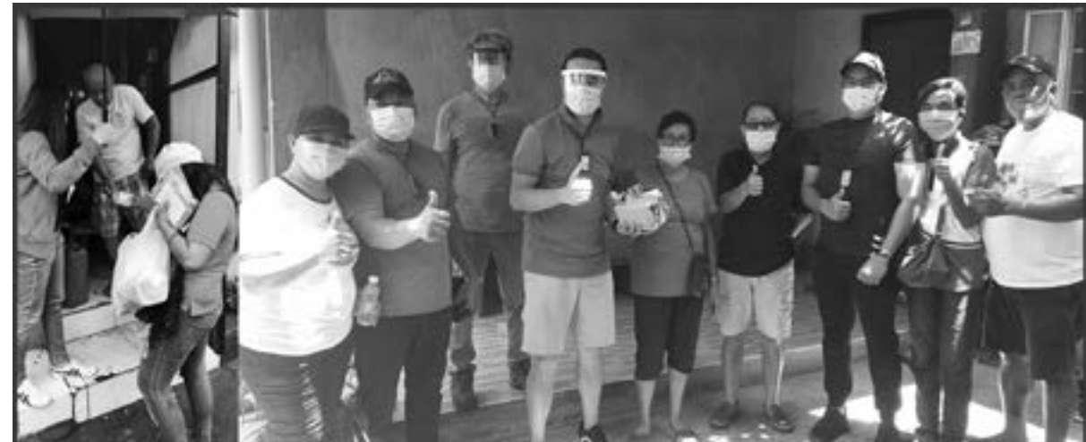
BOTIKA ON WHEELS CONTINUES IN KAWIT: Amidst the COVID-19 pandemic, the provincial government of Cavite continue to provide basic health services to the elderlies and children of the province through the Botika On Wheels program by delivering free maintenance medicines and vitamins to target beneficiaries. On July 13 – 17, 2020, the Botika on Wheels team roamed the municipality of Kawit where they distributed maintenance medicines and vitamins to almost 2,000 senior citizens. Likewise, more than 1,000 children also received vitamins to help strengthen their immune system. First District Representative Francis Gerardo A. Abaya supported the program and joined the team together with Vice Mayor Arman Bernal, some Sangguniang Bayan members and barangay officials in distributing the medicines to 23 barangays. The program prioritized elderlies and children as they are more vulnerable to COVID -19. (Janice D. Patulot)