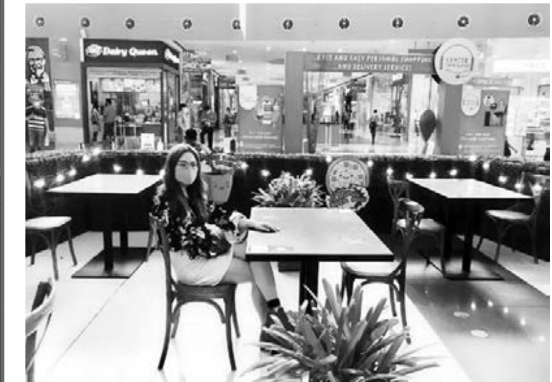
SM City San Pablo transformed its Atrium to an IG worthy Extended Dining Area as to promote physical distancing.

These days, your energy is spread pretty thin. Between social distancing, sanitizing your groceries, supporting local businesses, donating to campaigns, it's likely your days are busier than ever. You have gotten an ever-expanding list of "should" to tackle. And in the shuffle, you have probably forgotten to find windows to take care of yourself. And no, not all "self care" are all bubble baths and facemasks.