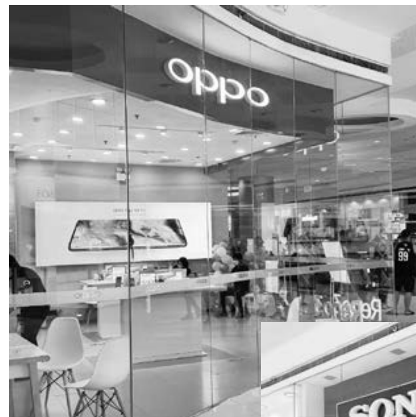
Check-out trendy mobile phone designs at OPPO