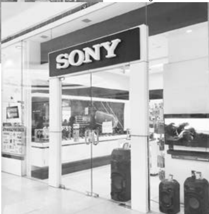
Grab your visual audio intelligent computers and smartphones from SONY VAIO

You can now enjoy gadgets and devices with fast and convenient pick-up or stay home while your new normal essentials are delivered to you by a personal shopper as SM City Dasmariñas redefines customer service during these challenging times. Through its Center Concierge, Fast and Easy Personal Shopping services.