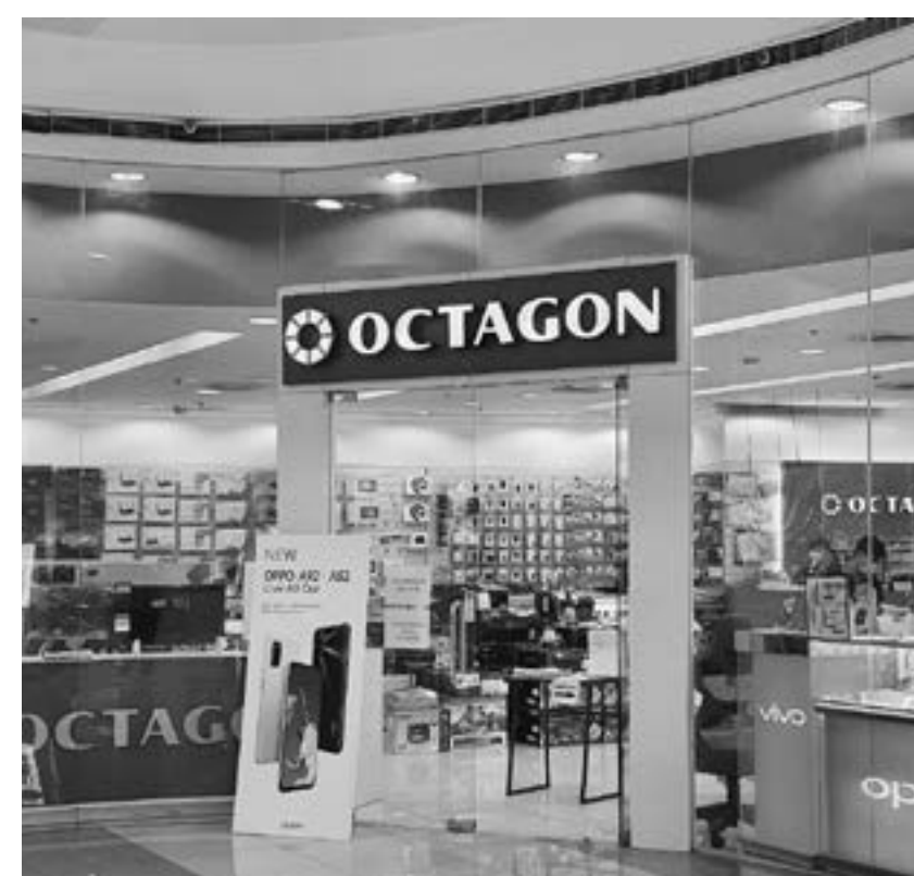
For any computer needs, go to Octagon SM City Dasmariñas