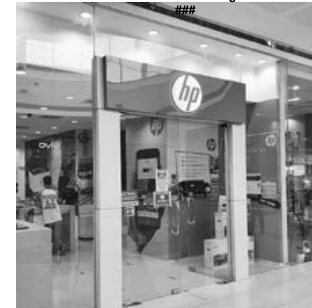
Get your computer set or laptop now from HP for the new normal schooling and meeting.