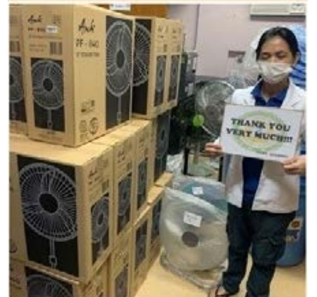
Cool comfort. SM Appliance Center donated Asahi stand fans to the Dr. Jose N. Rodriguez Memorial Hospital's (Tala Hospital).