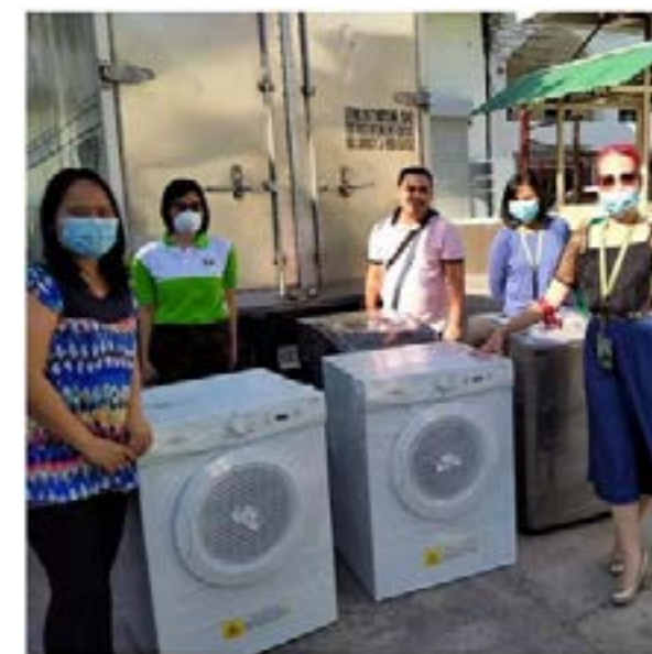
The bayanihan spirit was alive and well when SM Appliance Center and Whirlpool donated washing machines to the Rizal Medical Center. These were delivered by MegaTransport Logistics Corporation.