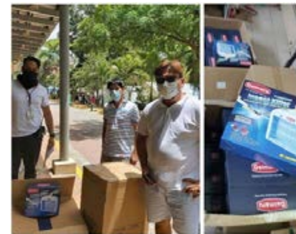
The National Kidney and Transplant Institute received additional assistance from SM Appliance Center with innovative mosquito zappers from Daimaru Neutron Industries Inc.