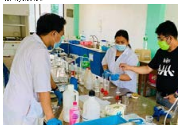
Research team testing the material with CSU President Dr. Anthony Penaso

The team used paper wastes, acid, base, and bleaching reagents to produce nanocrystals then integrated with nanocellulose film to increase the filtering capability of the product. According to Dr. Capangpangan, the nanocellulose crystals can also be extracted from agricultural wastes such as pineapple leaves and water hyacinth.