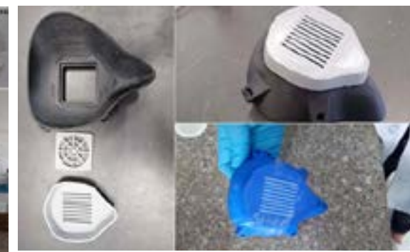
3D printed face mask produced by Caraga Fablab with the nanocellulose filter

The nanocellulose filter will cost around Php15.00 per piece, while the 3D printed face mask will cost Php300.00 per piece. Costs can still be lowered if mass produced. The face mask