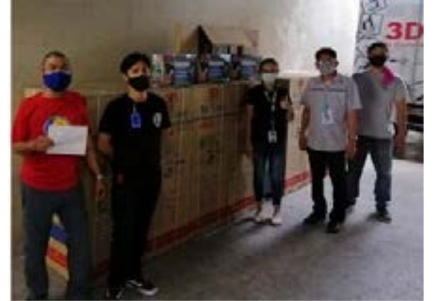
These 3D Insect Killers received by the National Kidney and Transplant Institute from SM Appliance Center will help to alleviate their situation within their COVID-19 complex tents. It uses ultra-violet light tubes to effectively kill flying insects anytime and anywhere.