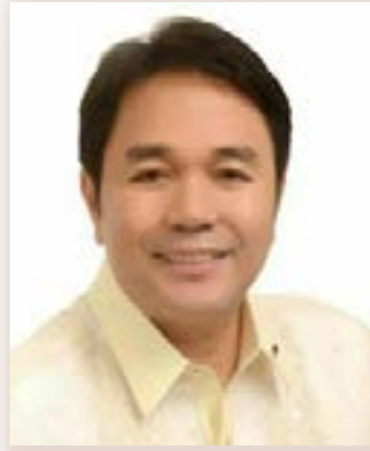
Mayor Edwin L. Olivares

VOL. XVIII > No. 2 > April 20-26, 2020 > P10.00