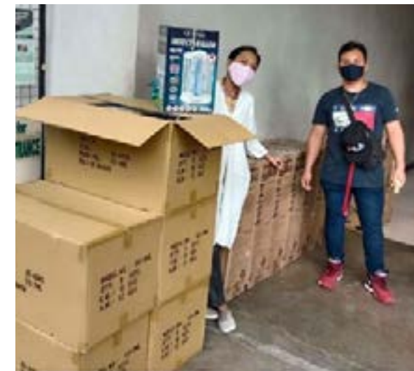
SM Appliance Center's donation of Imarflex insect killers to the Philippine Children's Medical Center will help keep their rooms free from harmful insects.

Tyson's Global Exchange Inc. also joined in SM Appliance Center's initiatives with donations of Speed Queen heavy duty washers for the Lung Center of the Philippines and Amang Rodriguez Memorial Medical Center. For more updates on SM Appliance Center and its CSR initiatives, you may want to visit our SM Appliance Center website at www.smappliance.com or like us at facebook.com/smappliances