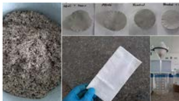
Shredded paper wastes and trial tests of the film material