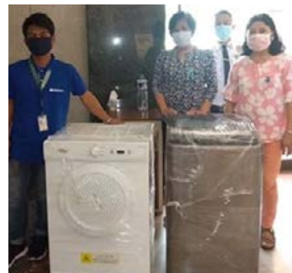
SM Appliance Center and Whirlpool donated inverter front load washers to support health workers with superior wash results to the San Juan De Dios Hospital.