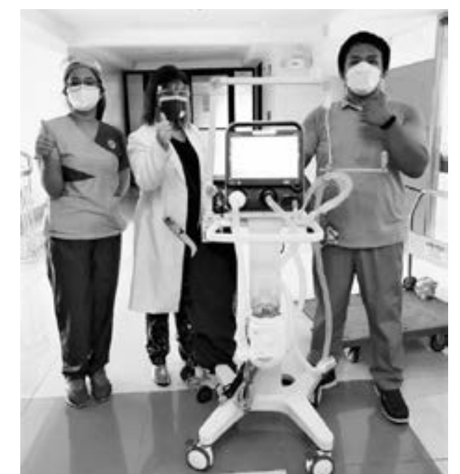
Calamba Doctors Hospital in Laguna