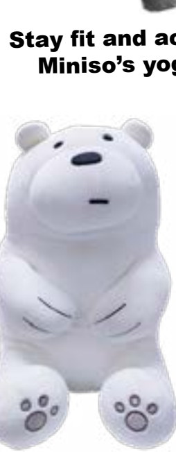
Huggable icy stuffy toy of We Bear Bears available at Miniso.