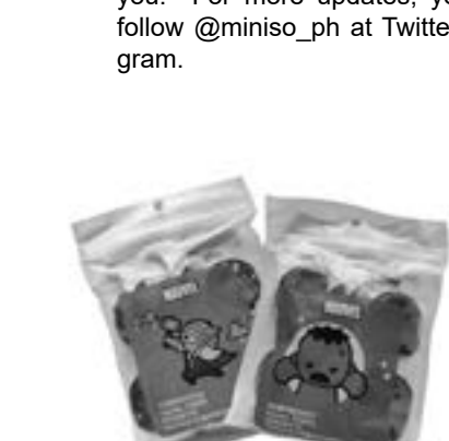
Complete your go-to hygiene kit with these Marvel compressed towels from Miniso.