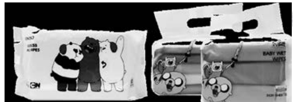
Practice good hygiene and proper disinfection at home and at work with these Miniso wet wipes.