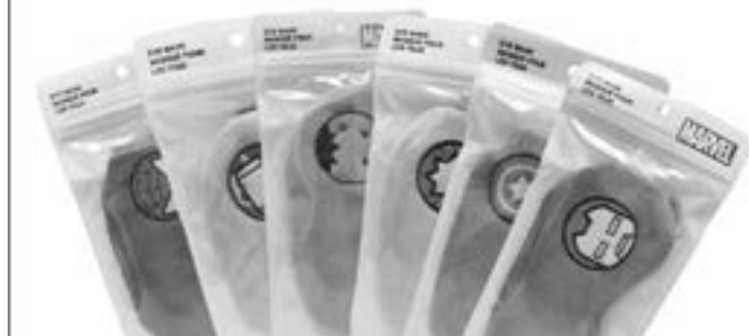
Sleep tight with these eye masks in Marvel inspired designs. Available at Miniso.