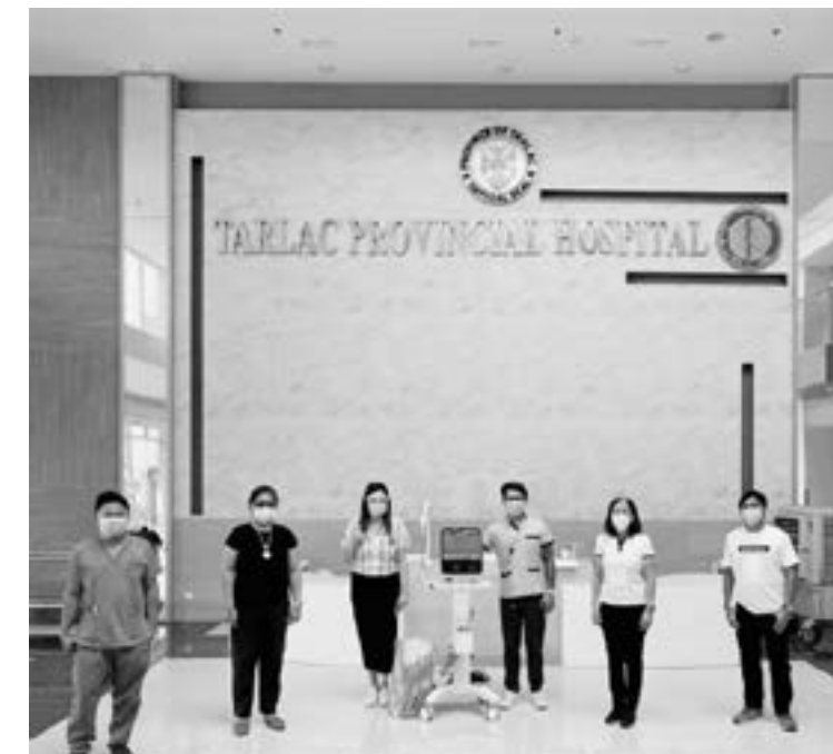
Tarlac Provincial Hospital in Tarlac City

To date, SM has donated almost Php 400 million in essential medical supplies, equipment, rt-PCR testing, and assistance to help national efforts in the fight against COVID-19.