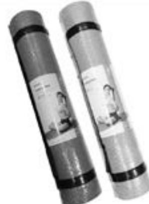
Stay fit and active with Miniso's yoga mat.