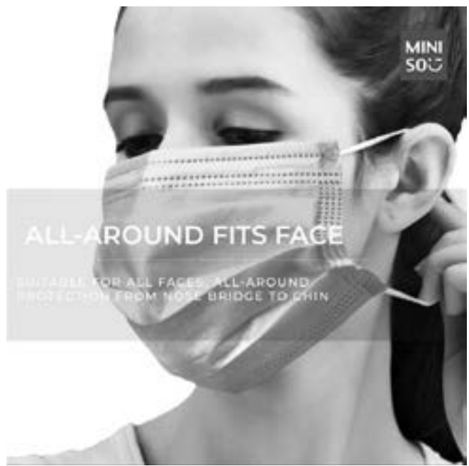
Keep yourself protected at all times with Miniso's All-Around Fits Face Mask which offers all-around protection from nose bridge to chin. Order yours now at Miniso.

Miniso brings in fun with its cute and colorfully designed everyday essentials for those spending more time at home. Better still, shopping is made more convenient and easy with these now available at Shopee and via Miniso's Special delivery and pick up service.