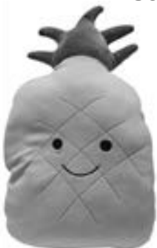
Bright and endearing pineapple stuff toy. Available at Miniso.