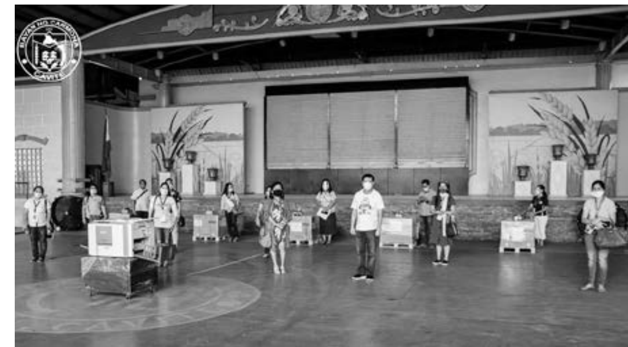
Carmona LGU distributes risograph machines and paper supplies to schools: On August 11, 2020, the Municipal Government of Carmona distributed 6 units of risograph machines and supplies of bond paper to public elementary schools, Carmona National High School, and Angelo Levarado Loyola Senior High School at the Carmona Town Plaza. This is to help in the production of materials to be needed by students for modular learning this coming school year 2020-2021.