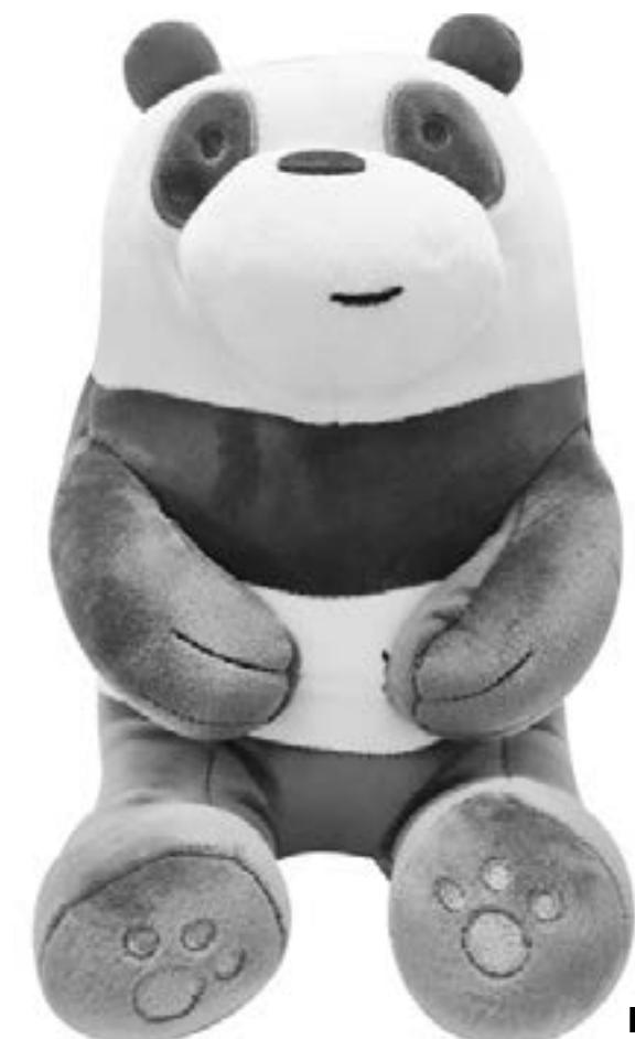
Adorable and fluffy Panda We Bear Bears stuffed toy from Miniso.