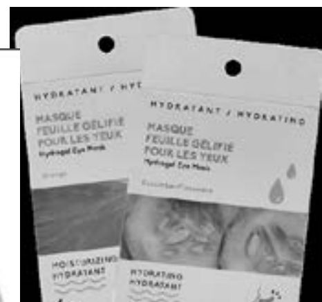
Reduce your dry skin, dark skin and fine lines around the eyes with these moisturizing Hyrdogel eye masks from Miniso. Available in orange and cucumber.