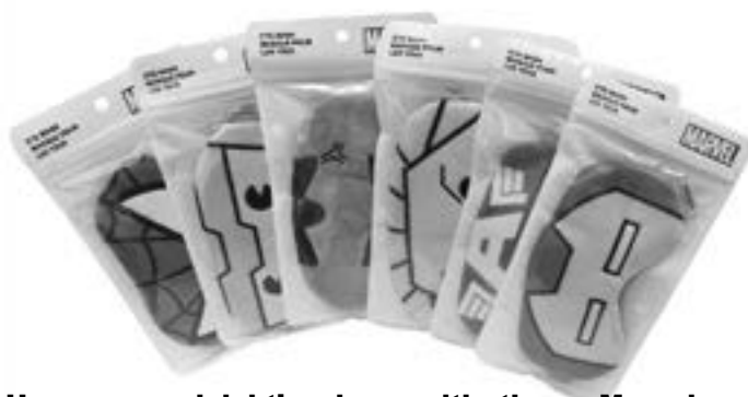
Have a goodnight's sleep with these Marvel eye masks from Miniso.

Let Miniso do the shopping for you. For more updates, you can also follow @miniso_ph at Twitter and Instagram.