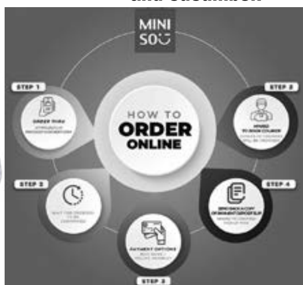
Check out this "how to order online" guide for a seamless online purchase at Miniso.