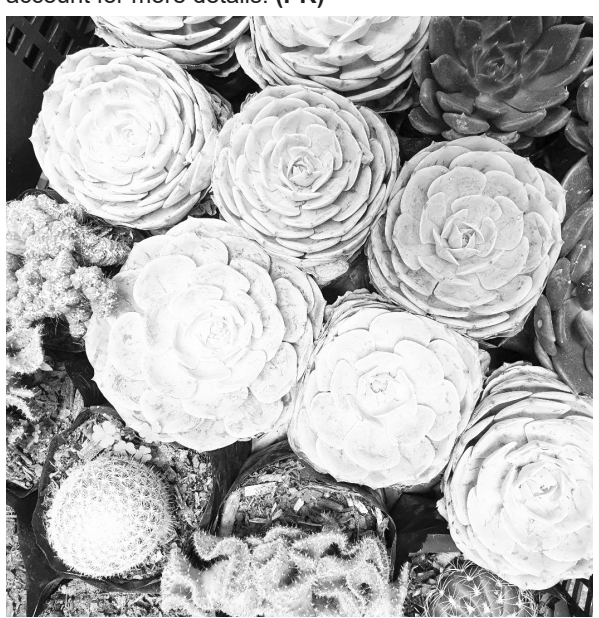
Pick your favorite succulent from the wide array of plants at Cavite's Happy Garden.

The Cavite's Happy Garden will run from September 10 to 24 at the Annex Event Center, happening simultaneously with SM City Bacoor and SM City Molino. Visit SM City Dasmariñas Facebook and Instagram account for more details. (PR)