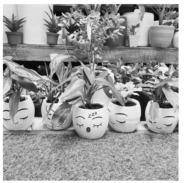
Plant pots have their own characters, too, just like plants.