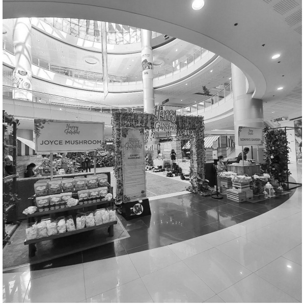
SM City Dasmariñas welcomes you to Cavite's Happy Garden!