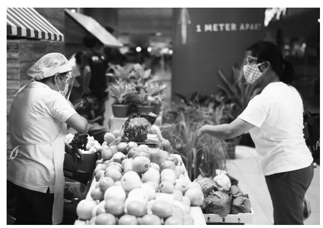
Happy garden features produce from Cavite Farmers.

Dateline Weekly Newspapers: September 7, 14 & 21, 2020