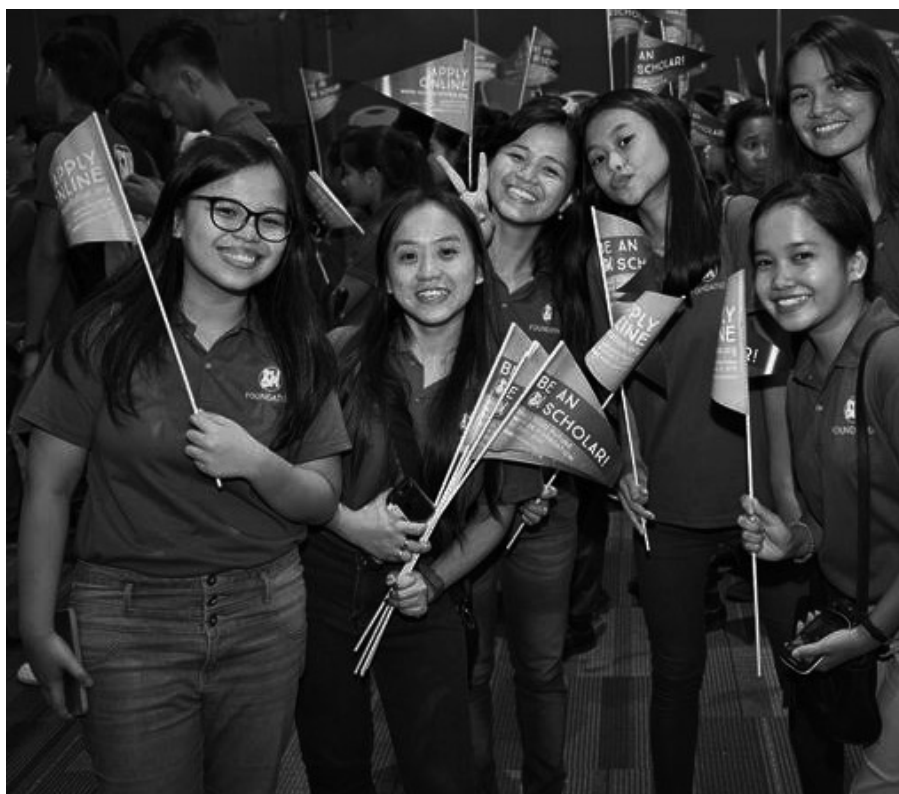
SM Scholars' General Assembly last 2019

SM Foundation (SMFI) announced the start of the online application period for the SM College Scholarship program for School Year 2021-2022 which will open on January 1 and end on February 28, 2021.