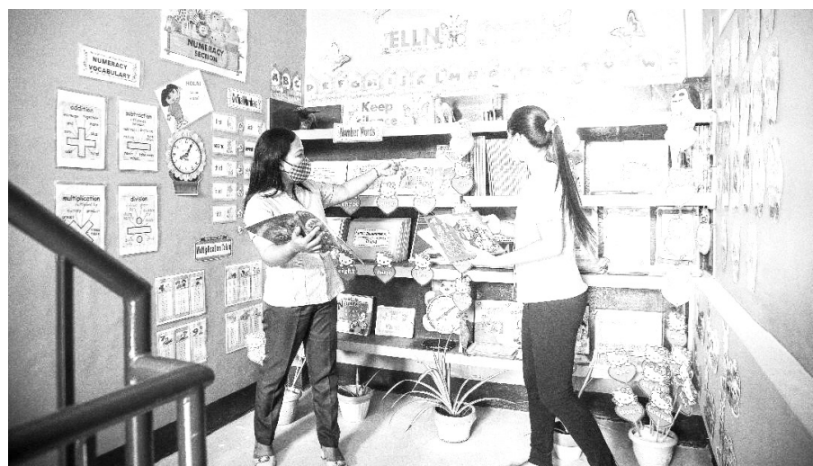
Literacy and numeracy corner to further help in the cognitive development of learners.