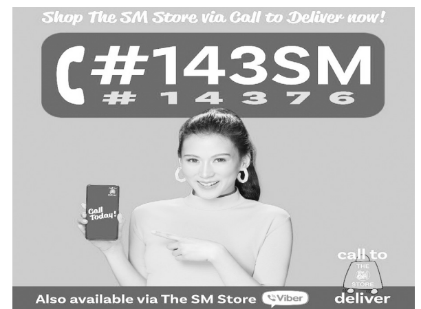
The SM Store's call to deliver is another exciting innovation that exemplifies SM's hybrid strategy to reach its customers and provide them convenient shopping options.