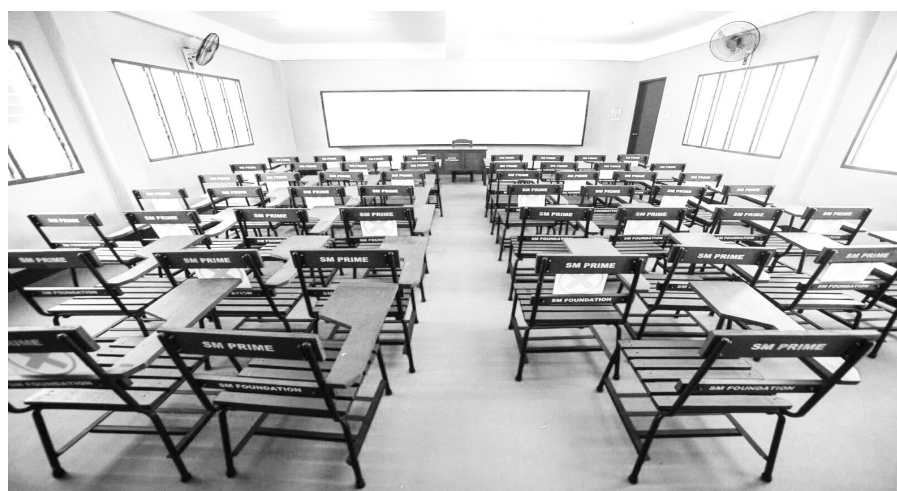
Fully furnished SM school building classroom.