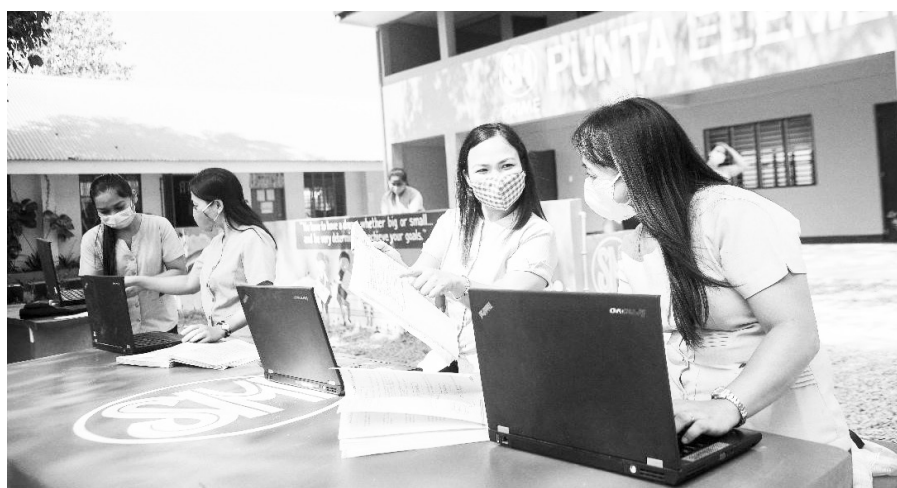
Teachers prepare for their lessons using the laptops from SM Foundation.

SM Foundation, through its School Building Program, is an active partner of DepEd's Adopt-a-School program. This social good initiative aims to promote quality public education by building classrooms nationwide.