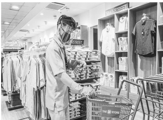
Shopping carts, baskets, and public areas are regularly disinfected and sanitized. This is just among the many safety precautions observed at The SM Store to ensure the safety of customers.

Aside from its commitment to continue giving the exceptional SM experience in its physical stores, online platforms and hybrid offerings, SM is also dedicated to ensure the safety of its customers and employees, all in the effort to win the fight against COVID-19.