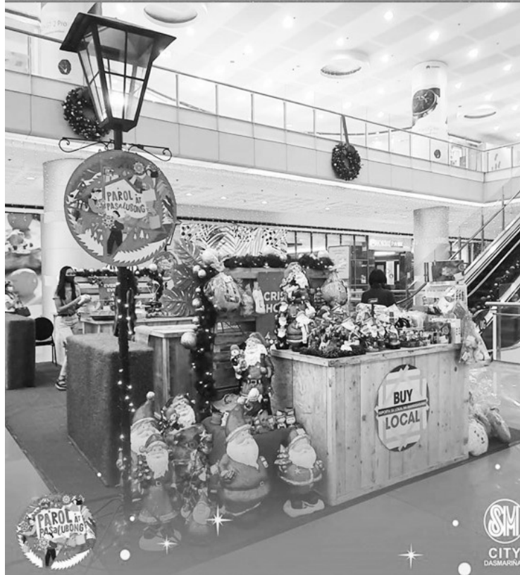
Feel the season of Christmas as SM City Dasmariñas brings you Christmas Market with different locally-made gift ideas and home decors for this holidays. Visit Parol and Pasalubong Christmas Market located at Upper Ground Level Annex, near Pepper Lunch.

The Land Bank of the Philippines (LANDBANK) has extended to the agriculture sector as of October this year a total of P230.23 billion in loans, which makes up 94 percent of its target of P245 billion for 2020.