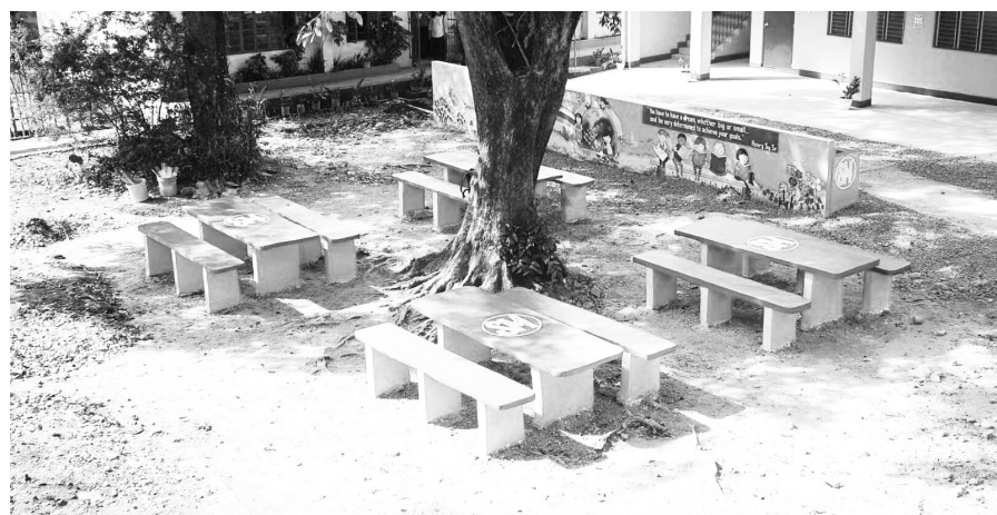
Green space in front of the newly turned over SM school building.