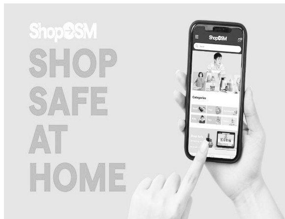
ShopSM, SM's own e-commerce platform, brings the SM experience online and allows customers to shop at the comforts of their own homes