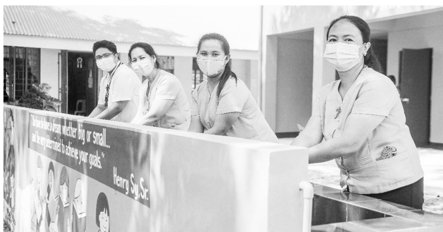
PES teachers utilize the 10-faucet handwashing facility installed in front of their newly turned over SM school building.