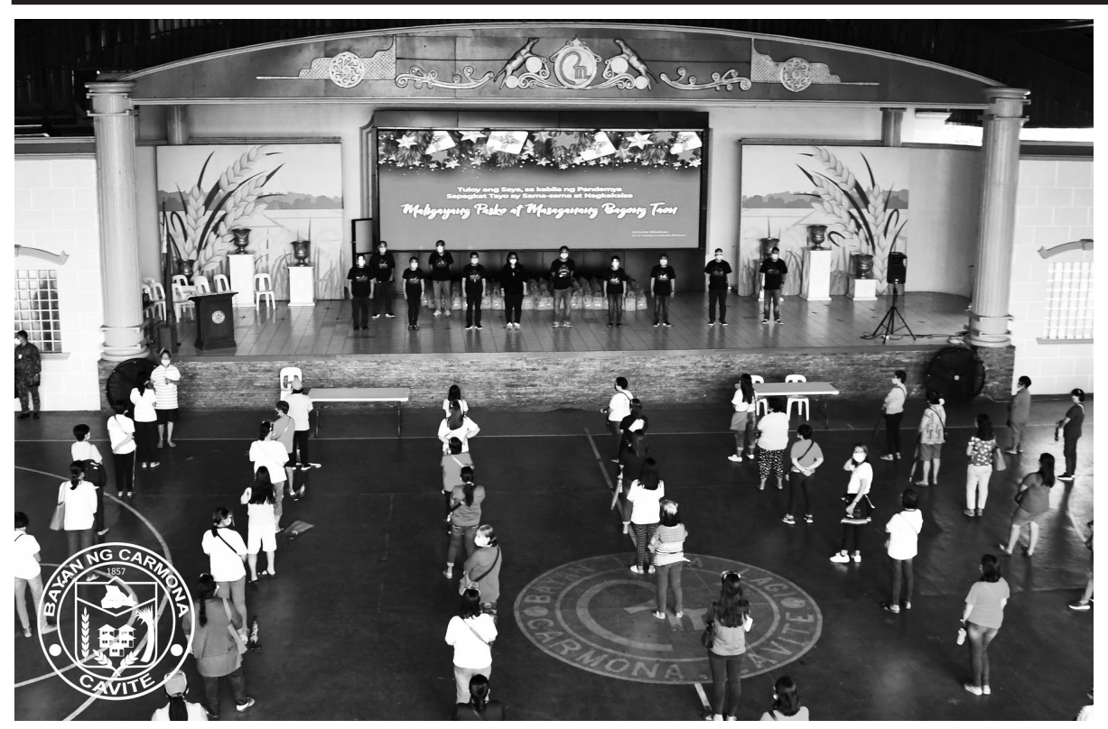
Carmona LGU distributes Pamaskong Handog to FHWs, BHWs, and EHWs: On December 10, 2020, the Municipal Government of Carmona along with the Office of the Representative of the Fifth District of Cavite distributed gifts or Pamaskong Handog to 325 Family Health Workers (FHWs), 125 Barangay Health Workers (BHWs), and 6 Environmental Health Workers (EHWs) at the Carmona Town Plaza. This is to recognize their contributions to the community and to promote the spirit of Christmas amid the COVID-19 Pandemic.