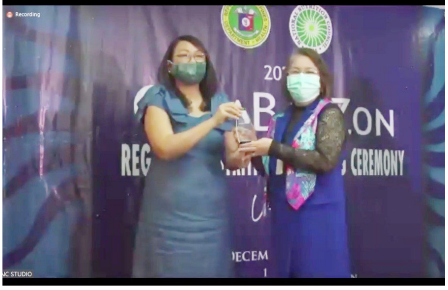
The National Nutrition Council IV-A holds its first virtual Regional Nutrition Awarding Ceremony in line with the guidelines set by the IATF due to the COVID-19 pandemic. (GG) Strory on Page 3