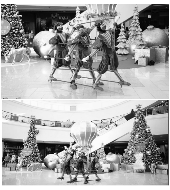
LOOK: Santa's Elves came a little early to make smiles and excitement contagious as they dance merrily at SM City Molino's Christmas Centerpiece. Check out SM City Molino's Facebook Page and see how these elves grooved to the sounds of Christmas.

SM CITY BACOOR, CAVITE – It is indeed getting cold outside because Dreiland Ice Cream is now ready to serve you a Premium Fruit and Chocolate Rolled Ice Cream! Enjoy their delectable flavors with your favorite kid at heart and make your day even sweeter with a cup of fresh and bursting flavors! Hurry and grab yours at Dreiland Ice Cream located at the Lower Ground Floor of SM City Bacoor. Enjoy!