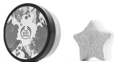
Drop the Festive Berry Starry Bath Bomb into your tub for a fragrant and berry-colored water then slather on the Festive Berry Body Butter to keep skin feeling softer and smelling sweet.