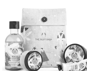
Dive into The Body Shop's sweetest festive fragrance with this little Winter Jasmine Little Gift Box. With four skin-softening body care picks.