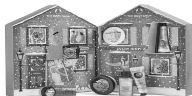
Count down to Christmas with a daily beauty treat with the Make It Real Together Advent Calendar. Discover 24 handpicked surprises from The Body Shop's new and favorite ranges

The Body Shop was founded in 1976 by Dame Anita Roddick in Little Hampton, England. The beauty brand pioneered corporate activism and was built on a philosophy that business can be a force for good. With its brand expression, Beauty with Heart, the company continues to be focused on five core values: Against Animal Testing, Support Community Fair Trade, Activate Self Esteem, Defend Human Rights and Protect The Planet. All products are created using the finest ingredients sourced from the four corners of the globe, which are not tested on animals and are 100% vegetarian. The Body Shop has been in the Philippine market for eighteen years with over 55 strategically located stores nationwide.