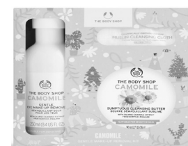
Wave goodbye to party make-up this Christmas with The Body Shop's gentle vegan, make-up removal made for sensitive skin.