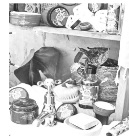
Sweet-smelling, tangy and as Christmassy as a sprig of holly, The Body Shop's Special Edition Festive Berry Range will surely give you all the festive feels