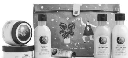
Hydrate your skin and hair with the Nourishing Shea Ultimate Gift Bag featuring six haircare and body care favorites