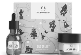
Festivities taking their toll? The Oils of Life Radiance Skin Kit with its intense nourishing duo is just the thing for skincare aficionados.