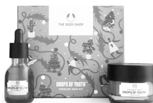
Give the gift of healthier, fresher-looking skin with the Drops of Youth Fresher Skincare Kit, including a Youth Concentrate and Day Cream.