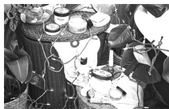
It's Warm Vanilla season as the warm, sweet, and cosy fragrance is back for your Christmas pampering. The Special Edition Warm Vanilla Range includes a shower gel, body scrub, body yoghurt, body butter, hand cream, starry bath bomb, and sugar lip scrub.