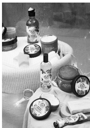
The Special Edition Winter Jasmine Range is fresh, crisp, and white as a winter's morning. Line includes Winter Jasmine shower gel, body scrub, body yoghurt, body butter, hand cream, and starry bath bomb.