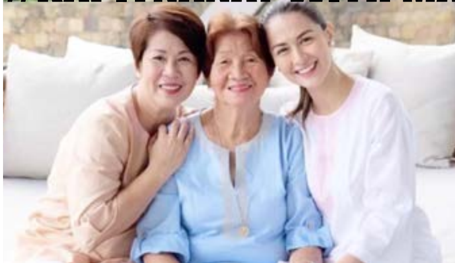
Marian Rivera with her two moms: her lola whom she considers her nanay and puso ng tahanan and her mom whom she is very close with and considers her best friend.

This Mom's Month, Marian Rivera-Dantes shares the story of the amazing moms who have molded her to become the person that she is today, and how she, as a mom, faces the challenges of our present situation with WalterMart.