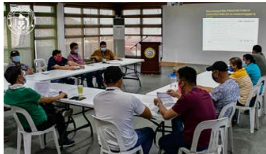
Carmona LGU conducts meeting regarding CCAP: The local government of Carmona held a meeting with the Sangguniang Bayan members on May 8, 2020 at the Municipal Penthouse to tackle the Carmona COVID-19 Assistance Program (CCAP). CCAP is the P2,000 financial assistance of the local government for households in Carmona who were not able to receive any cash subsidy from the national government such as the Social Amelioration Program (SAP).