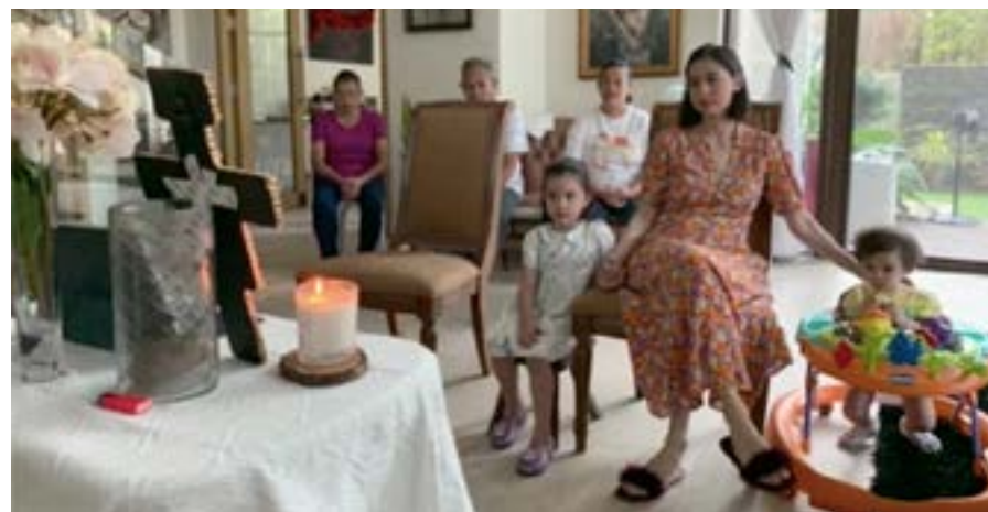
Marian instills in her family and kasambahay the importance of praying together and to have faith in God which her nanay taught her.