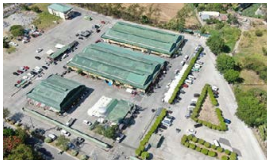
Carmona LGU delivers situation reports through drone shots: In line with the local government's mitigation efforts to prevent coronavirus disease (COVID-19) in the community, drone shots situation reports at Carmona Public Market and Barangays 1 to 3 were released on May 8, 2020 for strict monitoring of the implementation of the local government's social distancing measures.