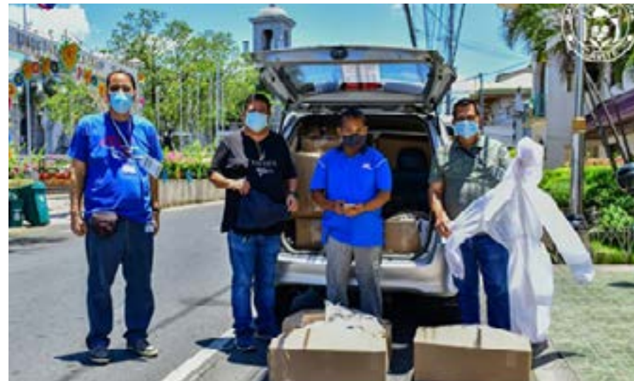
Donors continue the spirit of #BayanihanMunaLagi this COVID-19 season: On May 8, 2020, donors from the public and private sectors continue to help Carmona residents and frontliners through various donations.