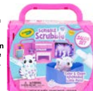
Groom your own little pet with Crayola's Scribble Scrubbie Salon Set from Toy Kingdom.