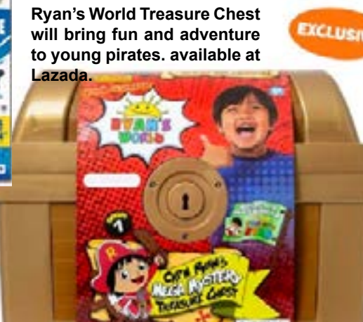
Ryan's World Treasure Chest will bring fun and adventure to young pirates. available at Lazada.

Keep your kids' mind active with this Cogo's City playset. Available at Lazada.