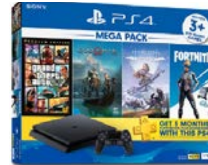
An enjoyable home entertainment awaits kids and kids at heart with Toy Kingdom's PS4 Mega Pack which includes three bestselling games and three-month subscription to PS4 plus. Get yours now at Lazada.