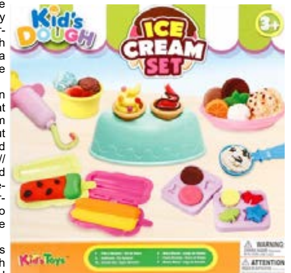
Let your kids create sweet desserts with Kid's Dough Ice Cream playset from Toy Kingdom.

For more updates visit www.toykingdom.ph and follow ToyKingdomPH at Facebook and Instagram.