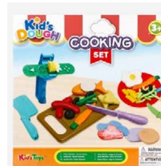
Aspiring little chefs will surely love this Kid's Dough Cooking playset from Toy Kingdom. Available at Lazada.

Keep your kids' minds creative and inspired with games from Cogo in city and farm themes. Board games like Uno, Monopoly, and Pictionary Air are great for family bonding and fun;