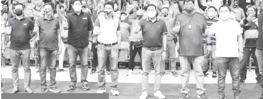
City Government of Imus

Inilunsad ang Vacc to Normal campaign ng Grab Philippines sa bayang ito noong Agosto 6 sa pangunguna ng Imus City Local Economic Investment and Promotions Office (LEIPO).