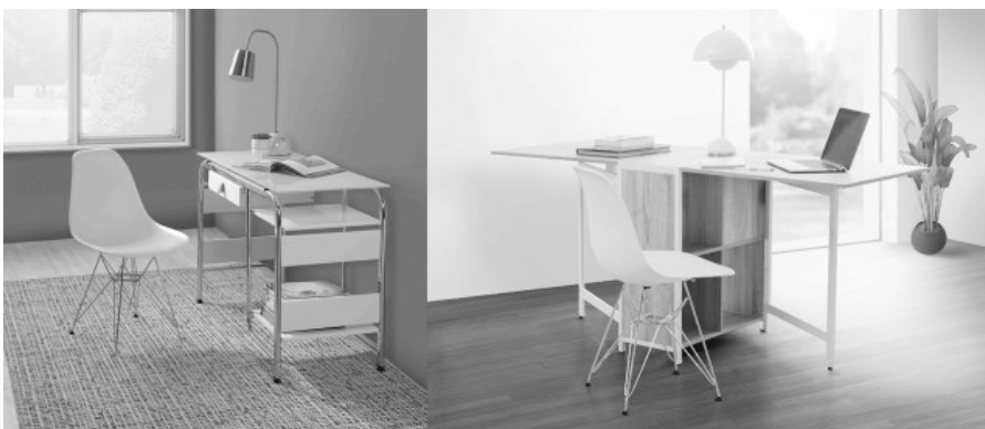
Glass, wood, and metal blend in beautifully in this modern contemporary designed white Havana Computer Desk.