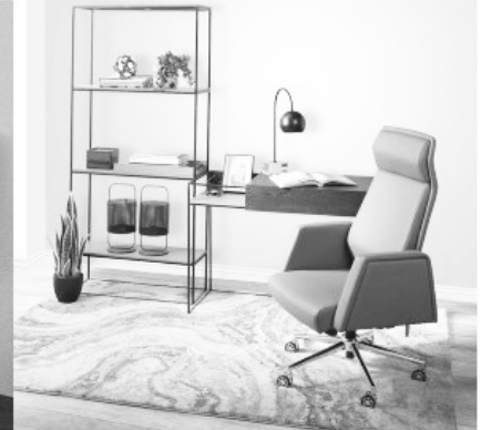
Our Home's Farkins Office / Study Desk has one side for writing and paper work, and another side for storage and décor.

After more than a year of working from home, it's time to indulge yourself by creating a working space that's both decorative and functional. And most likely, the desk will be the centerpiece of one's home office in terms of design and activity.