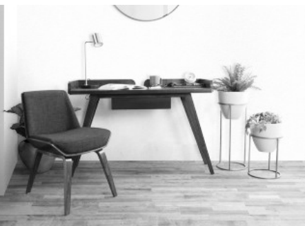
Create a streamlined workspace with this sleek and polished Gavin Office Desk.

And it offers some tips when choosing your dream desk.