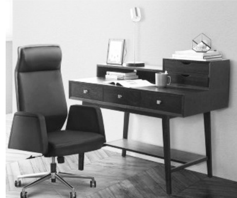
Classic Hambu Writing Desk in elegant dark wood finish has both open and pull-out drawers for a more organized work space.