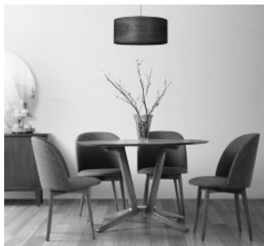
Dinner for four in a small dining space? Not a problem with Our Home’s Ancona 4-seater dining set.