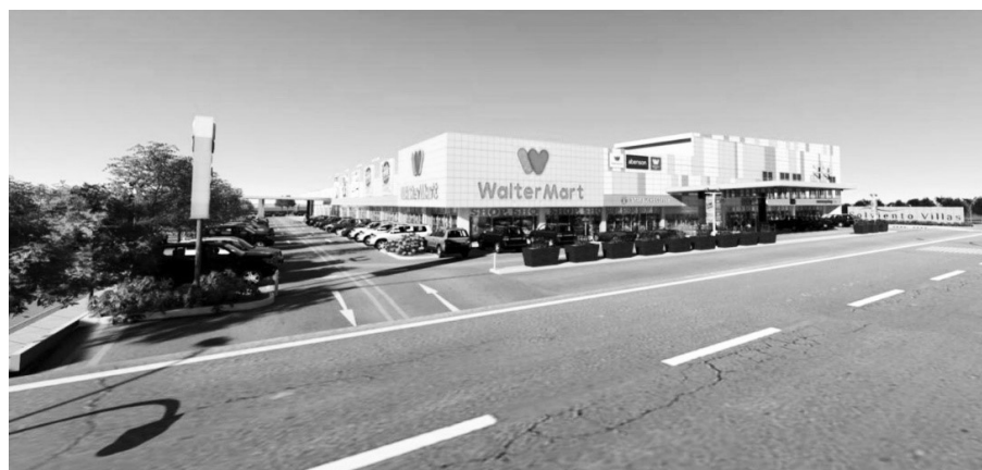
The WalterMart Bacoor opens on October 30, bringing a convenient and enjoyable shopping experience to Caviteños. It is located in Molino Blvd., Brgy. Mambog IV, Bacoor, Cavite.