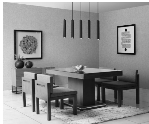
Great dining and great conversation starts in this Alvea 6 Seater Dining Set from Our Home.