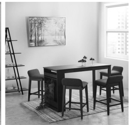
Here’s something for those who prefer to keep things informal and relaxed. Our Home’s Ethane Dining Set is a stylish bar table set that lends an air of casual comfort to any dining space, big or small.

With that, we are rethinking our dining rooms with the modern multifunctional table as the centerpiece. And the good news is that there is a lot of table talk from Our Home which also offers us some tips when selecting the dining table for your space.