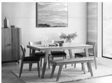
Make your dining experience fun and exciting with Our Home’s Fredrik Dining Set with a rustic charm combining the casualness of a bench setting and the elegance of a dining chair.