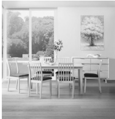
Create a light and welcoming ambiance to your dining room with this white Panfield 6-Seater Dining Set from Our Home.

The new-norm has redefined the importance and functionality of a dining table - transforming it into a WFH station, an online school stop where one does homework and art projects, and a hobby hub. That is, of course, apart from being a gastro address for home cooked specialties and the take-out favorites we have come to love.