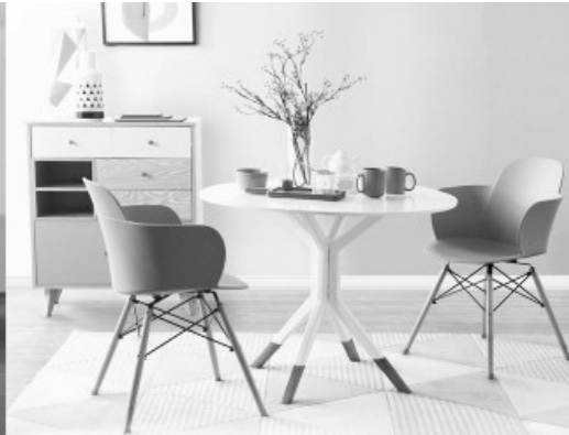
A breakfast for two with Our Home’s Scandinavian-inspired foldable Jada Dining Table. Perfect for small spaces, pair it with a couple of Iona Dining Chairs for a great dining experience.