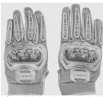
Stay digital and connected while biking with these soft, durable, and flexible touch screen gloves Available at Men's Accessories Department at The SM Store.