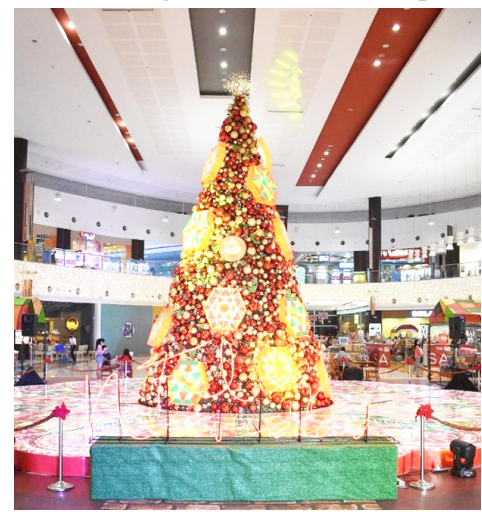
The Centerpiece greets the shoppers Feliz Navidad!