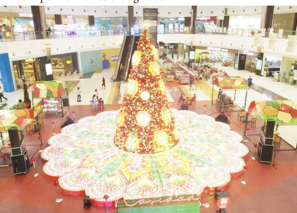
25\mbox{-}foot Christmas tree surrounded by a giant parol base sparkles at the center of the mall atrium of SM City Rosario.

The lighting of the Christmas tree brings us a more meaningful Christmas celebration despite challenges that the pandemic has brought us.