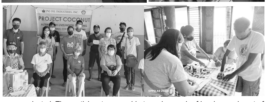
was conducted. The participants were able to make a pair of insoles made out of coco coir.