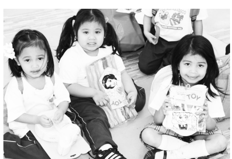
Little girls from Eugenia Ravasco Day Care Center in Paranaque City were some of the recipients during the Share A Tov campaign.

New bundles of toys were given to the preschool students of the Eugenia Ravasco Day Care Center during the recent turnover ceremony of The Share A Toy campaign of The SM Store and Toy Kingdom.