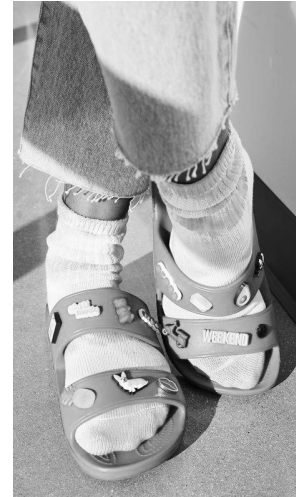
Unisex style with a two-strap upper. Two upper straps offer even more comfort and foot security with this Unisex Classic Crocs in Cobalt Blue, with seven holes on each shoe that allows you to personalize them with ‘Jibbitz™ charms’.