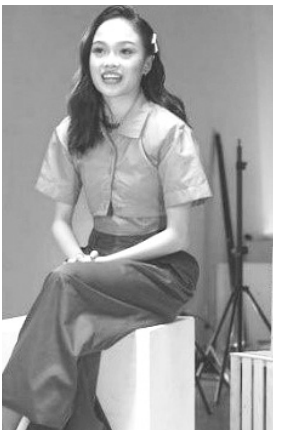
Fast-rising dancefloor sweetheart AC Bonifacio uses Crocs as a canvas for self-expression with personalized ‘Jibbitz™ charms and hailing all to ‘Come As You Are.’