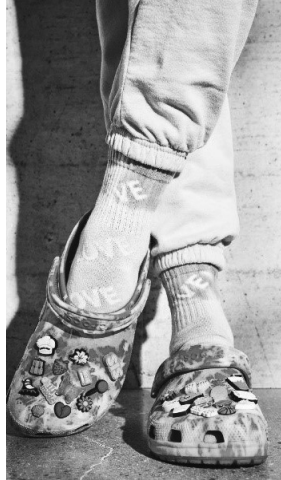
Lightweight and flexible. This iconic clog, now with a bleach dye design features 13 holes to its shoe to allow stylish personalization with unique ‘Jibbitz™ charms’, anywhere and anytime, allowing everyone the ability to be truly comfortable in their shoes.