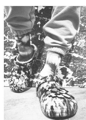
Comfort and style. This stylish classic clog with allows everyone the ability to be truly comfortable in their shoes with its bleach dye design with a print for every personality includes easy to clean features, pivoting heel straps for a more secure fit and customizable with ‘Jibbitz™ charms’.