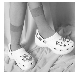
Women Classic Platform Clog White. When you’re in the mood for a little extra boost, you can style it up with this classic platform clog which features a heightened, contoured outsole that supports the upper and love with a slimmer, sleeker look and the customizable backstrap which also holds ‘Jibbitz™ charms’, so you can personalize your look even more.