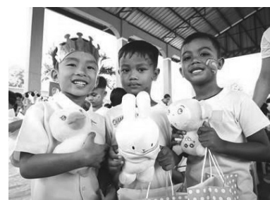
Little boys from Looc Elementary School in Batangas happily raise their new plush toys from The SM Store during the Share A Toy project.

SM shoppers can play Santa to less fortunate kids this Christmas in The SM Store and Toy Kingdom’s Share a Toy project, from November 1 to December 31, 2021