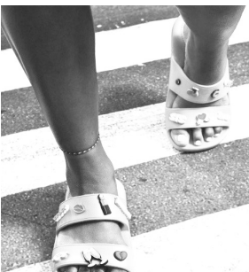
Incredibly light and fun to wear. Enjoy the look and feel of the comfortable Classic Clog and Crocs Slide in sandal form with this Classic Crocs Sandal with 7 holes in each shoe and customizable ‘Jibbitz™ charms.’