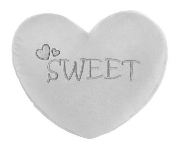
Say it sweetly with this delightful Valentine pillow. Available at Miniso.