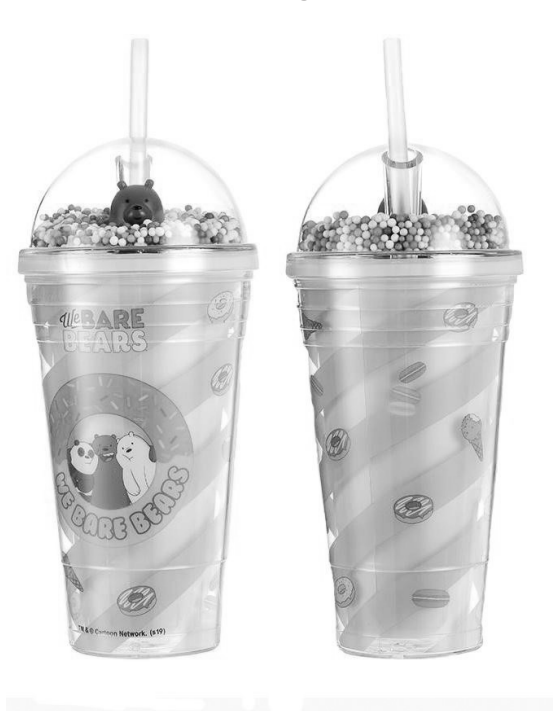
Stay healthy and hydrated with this We Bear Bears pink tumbler.