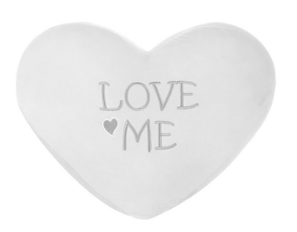
Express your love with Miniso's heart shaped pillow. Available at Miniso.

For more updates you can also follow @MinisoPhilippines at Facebook and Instagram.