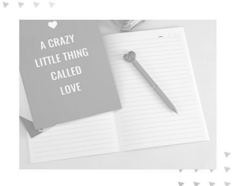
Miniso's Valentine inspired notebook and pen is perfect for love notes and love thoughts

The write stuff. Jot down notes, daily schedules, and creative expressions in these notebooks fun and fancy notebooks