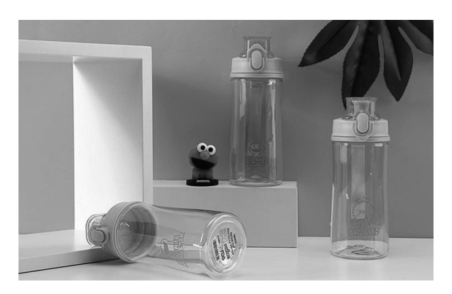
Water bottles in Cookie Monster designs for your everyday use. Grab yours at Miniso.