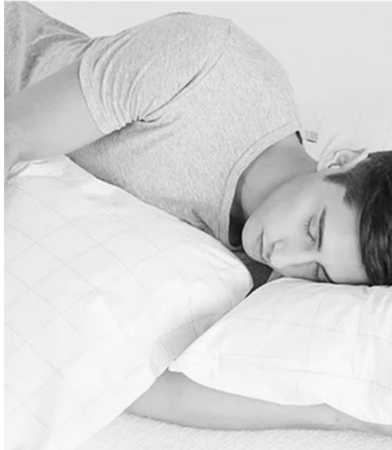
This Mr. Big Bodyscale pillow is filled with Elasta Fiber to fit snugly and promote the healthy firmness of your body.