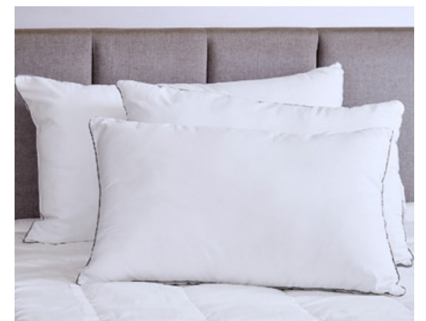
Experience hotel slumber right from your home with Select Hotel Pillows.

every five to eight years. This helps to alleviate tension at the back and prevent aches and pains.