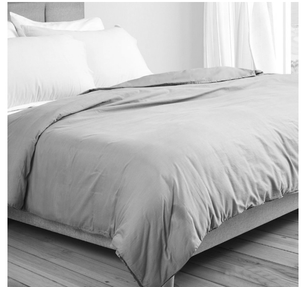
Improve your sleep with a quality weighted blanket that offers massage therapy for both adults and kids alike.