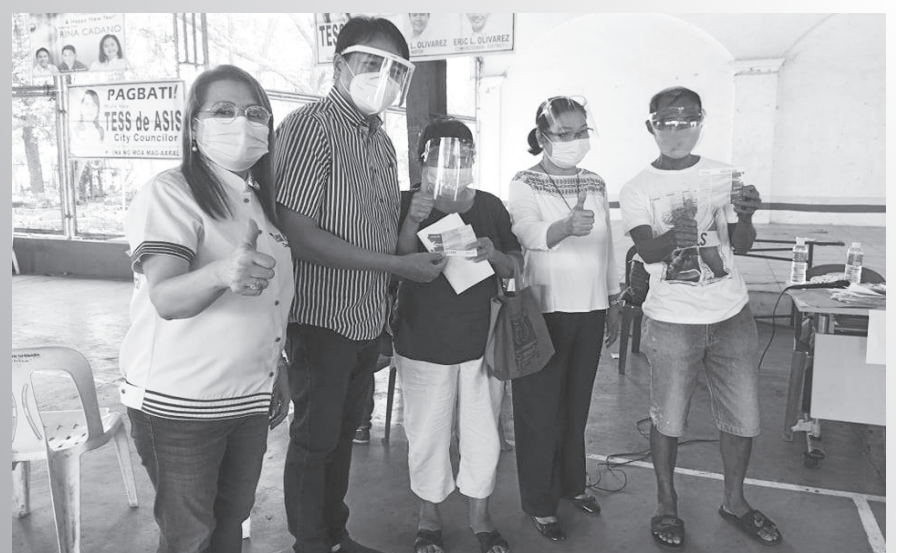
DISTRIBUTION OF GIFT CERTIFICATE FOR NON-OSCA CARE MEMBERS SENIOR CITIZEN OF THE CITY OF PARAÑAQUE (BARANGAY SAN ANTONIO): Photo shows during the Giving gift certificate for beloved Senior Citizens of Parañaque City led by Parañaque City Mayor Edwin L. Olivarez, Vice-Mayor Rico Golez, Congressman Eric L. Olivarez and City Council of Parañaque City in cooperation with sixteen barangays and Office of the Senior Citizen Affairs (OSCA).

SM City Dasmariñas gives you the best of the season! Good food, good vibes and good music! Chill and relax as you eat with your friends, family and loved ones. Experience these at SM City Dasmariñas where everything tastes better when dining alfresco. Visit its Streetside eats at the Main Mall entrance, opens from 4PM to 9PM.