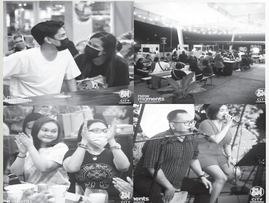
Day full of love at SM City Dasmariñas

SM CITY BACCOOR, CAVITE – Cheese is the day for you to grab and enjoy endless Mozzarella Cheese at ChizMozza – SM City Bacoor! Grab a big Mozzarella Bite and Wow Sticks as you enjoy catching up with your besties and family! Hurry and head on to SM City Bacoor's Food Court located at the 4th level and save the best spot for your chizy friends!