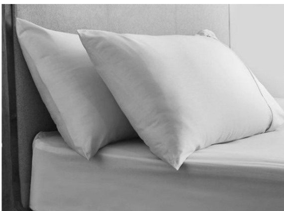
Canadian Organic Cotton sheets with 220-Thread count Fabric and made without the use of pesticides and other harmful chemicals, that are soft and smooth on the skin.

There’s nothing like a good night’s sleep to make us feel healthier and happier. It helps reduce stress, improves your attention and concentration, takes care of your emotional well-being, and can help improve your memory. At the same time, it is said to keep your heart healthy, strengthen your immune system, lower your blood pressure, reduce your chances of diabetes, and help you maintain your weight.