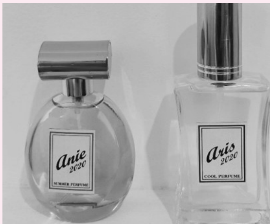
CARD Astro launched its newest perfume brands inspired by every social development practitioner in the country who has contributed to poverty eradication.

"We are one with CARD MRI in providing opportunities for women and their families through our products and services. We are aiming to create a big-