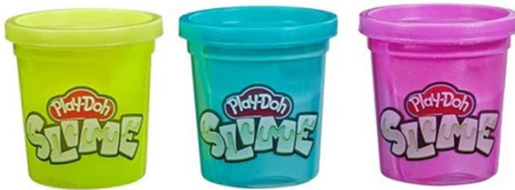
Stay creative and playful with Play-Doh Slime.