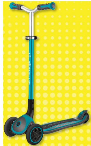
Globber Master 3-Wheel foldable scooter.