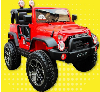
Rux Motorized Off-Road Cruiser