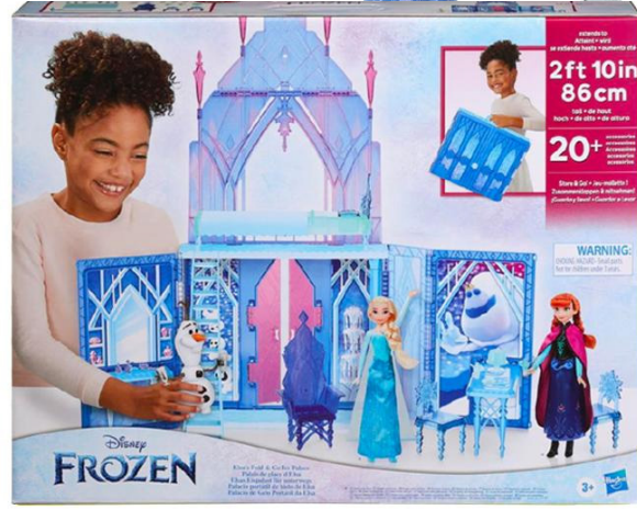
Take frozen fun on the go with Disney's Frozen 2 Elsa's Fold & Go Ice Palace Playset.