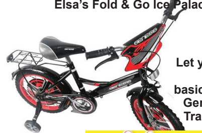
Let your child learn bike basics with the Deck Genesis 16" with Training Wheels.