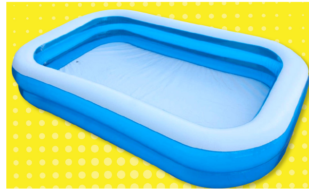
Summerize your backyard with this Giant Rectangular Pool.