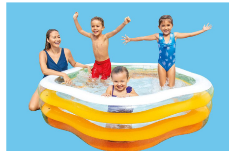
Enjoy a summer splash with the family with this Intex Summer Color Pool.