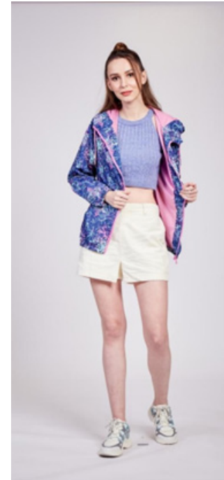
Pretty in pastels: floral print full zip jacket, knitted cropped top, and twill shorts.