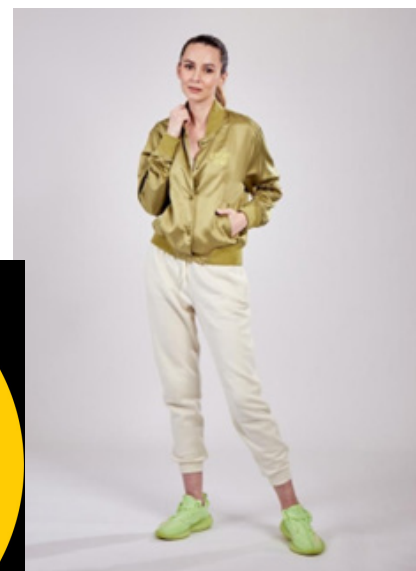
Active style meets color with this yellow bomber jacket worn with jogger pants