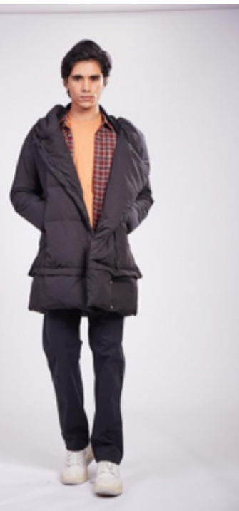
Love that layering! Keep warm and in style with this padded trench coat worn over a flannel shirt, basic tee, and twill pants.