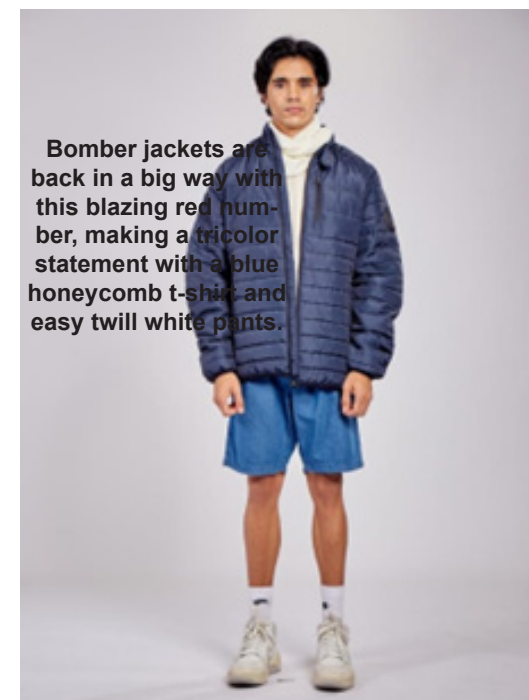
The classic puffer jacket and easy shorts for great weekend style