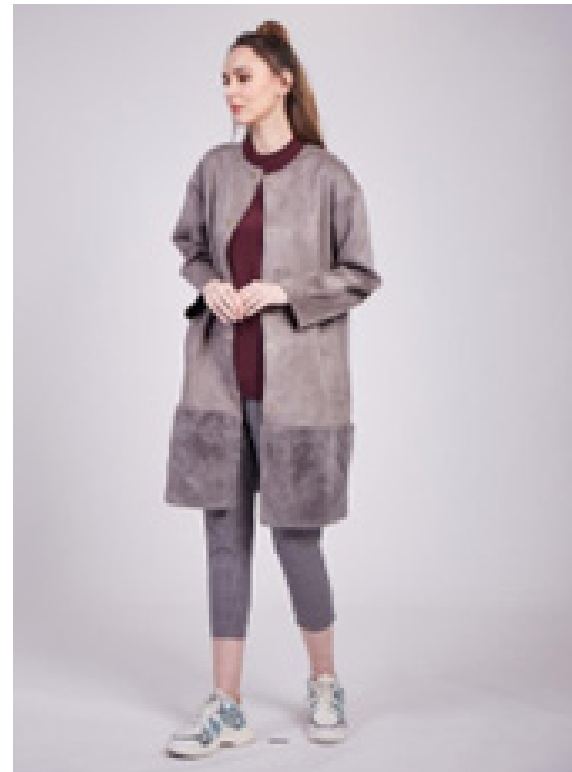
Soft and supple grey jacket is a perfect pack for our wintry holidays. Worn with a pullover and matching pants.