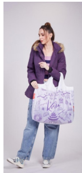
Faux fur trimmed winter jacket matched with a knitted top and denim pants.

finds expression today in oversized, minimalist styles. The Surplus coat and jacket collection is available in Surplus stores in most SM malls nationwide. For a more convenient shopping experience, you may check out Surplus at Lazada, SM Malls Online, and ShopSM. Surplus Order to Deliver is also now available; join their Viber community and follow them on Facebook and Instagram @SurplusPH and @Surplus_ph for more details.