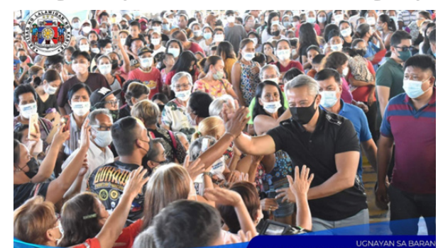
TAPAT SA BAYAN, TAPAT SA USAPAN. NOVEMBER 27, 2022 | SAN ISIDRO LABRADOR 2, DASMARIÑAS