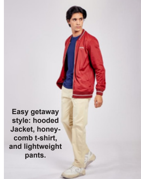
Easy getaway style: hooded jacket, honeycomb t-shirt, and lightweight pants.