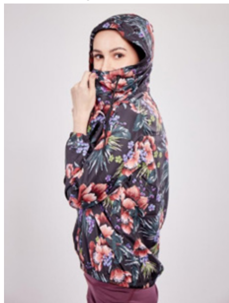
Floral printed water repellent hooded jacket