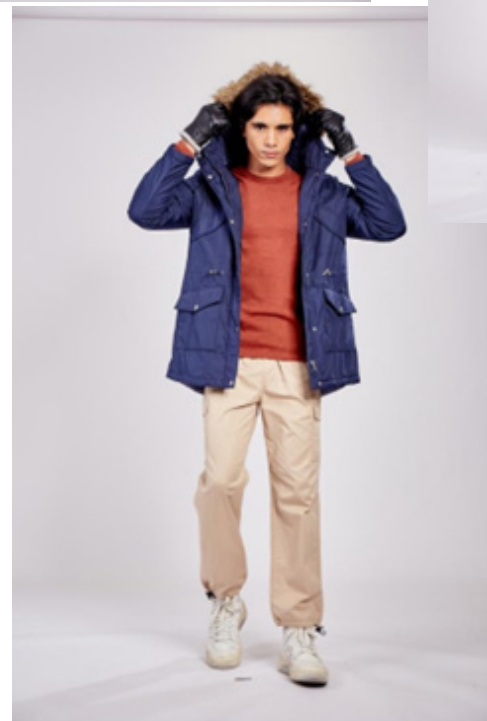
Great travel mates: blue hooded winter jacket, knitted sweater, and easy cargo pants.