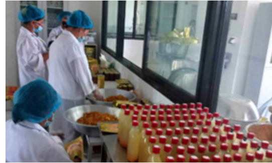
LANDBANK-funded ‘Cocohub’ boosts Cebu farmers’ income

TUBURAN, Cebu – When Super Typhoon “Yolanda” devastated parts of the country in 2013, coconut farmers from this town struggled with lower productivity and income. They were left with damaged coconut farms, making it even harder to earn a living for their families. This dire situation pushed the Lamac Multi-Purpose Cooperative (LMPC) to support its farmer-members by establishing a production center for diverse products made from coconuts, which provides farmers with higher income from selling all parts of their produce to LMPC at a competitive price, instead of relying solely on producing copra. The Coconut Hub or ‘Cocohub’ facility, the first-of-its-kind in Cebu, commenced