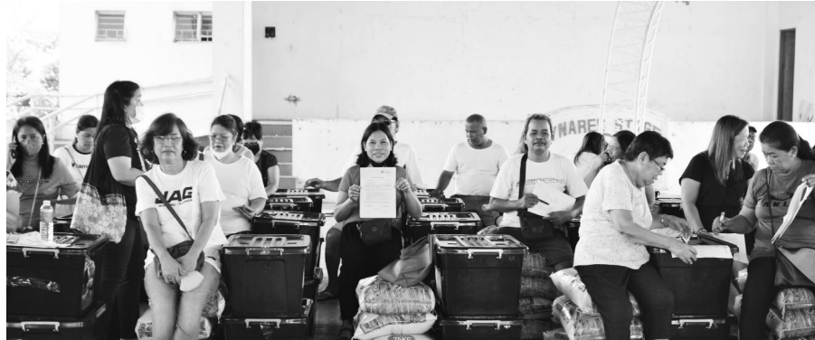
29 November 2022 – The Department of Trade and Industry – Rizal Provincial Office through Negosyo Center Morong and Cardona awarded livelihood kits to beneficiaries under the Pangkabuhayan sa Pagbangon at Ginhawa (PPG) Program at the Municipal Covered Court, San Pedro, Morong, Rizal. A total of thirty (30) sari-sari

stores beneficiaries profiled from Morong and Cardona, Rizal, were awarded livelihood kits worth Php 10,000.00 each.