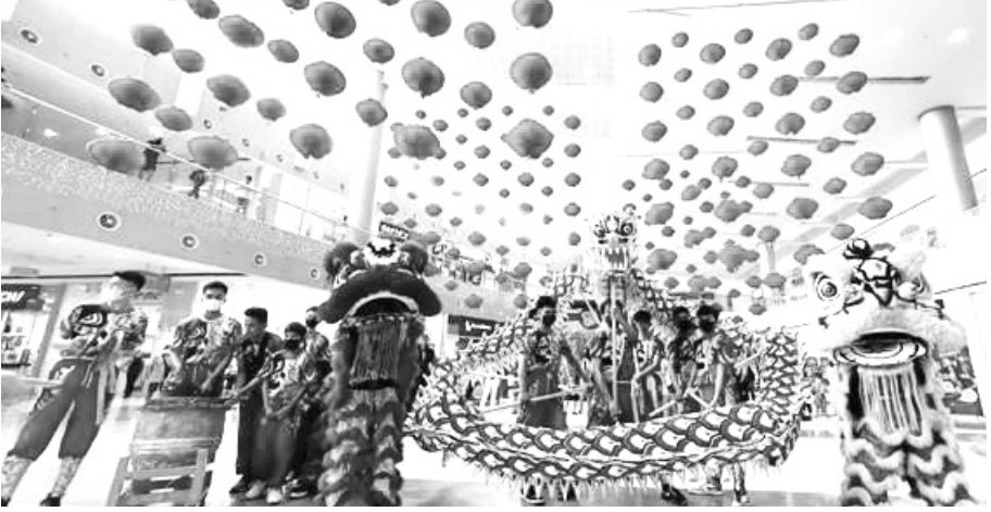
Lion and Dragon Dancers perform at the Mall Atrium of SM City San Pablo in the morning of the Chinese New Year.

This 2023 Hop in to Luck as SM City Malls in Laguna celebrates the Year of the Water Rabbit with the traditional Lion and Dragon prosperity dance. Shoppers were thrilled to see the dragons around the mall in search of the lucky hanging hong baos. Chinese New Year has always been about tradition and spending time with your families that is why SM Supermalls prepared some CNY themed treats for the shoppers . #Luckyyearoftherabbit #EverythingshereatSM.